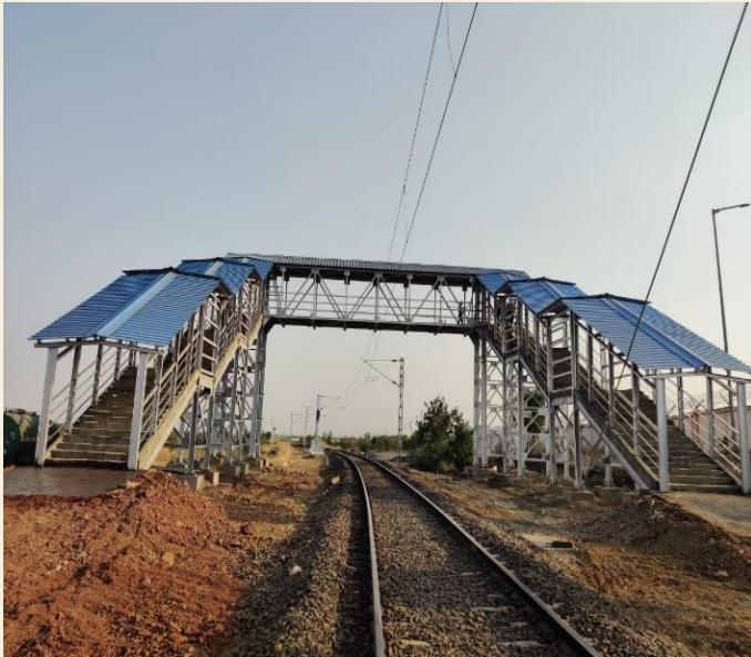
Fig 14: 1x14m FOB at for NTPC Kudgi, Karnataka