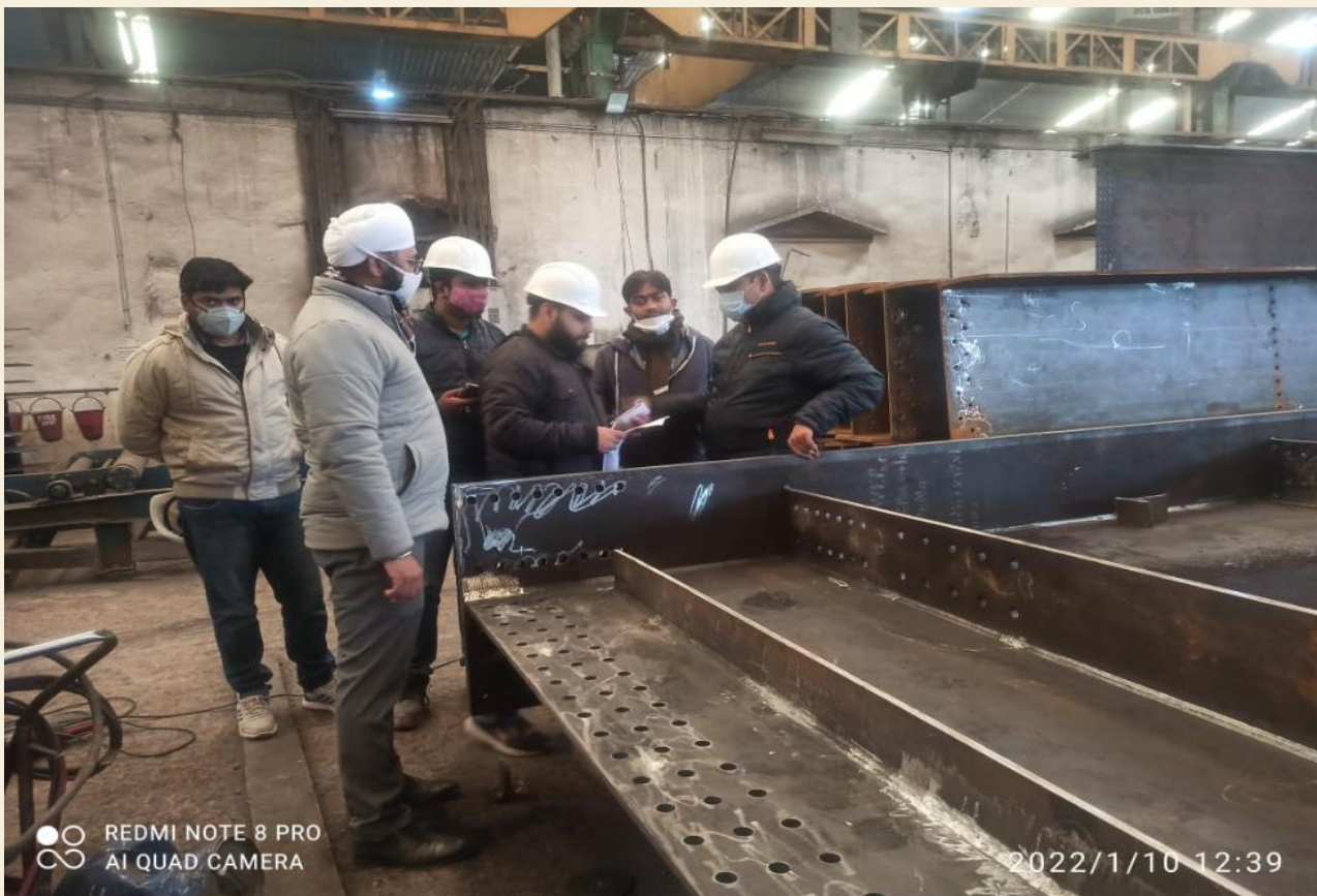
Fig 10: Inspection of Fabrication works for RVNL Bhanupalli- Bilaspur-Beri New Rail Line at M/s HMM Ambala.