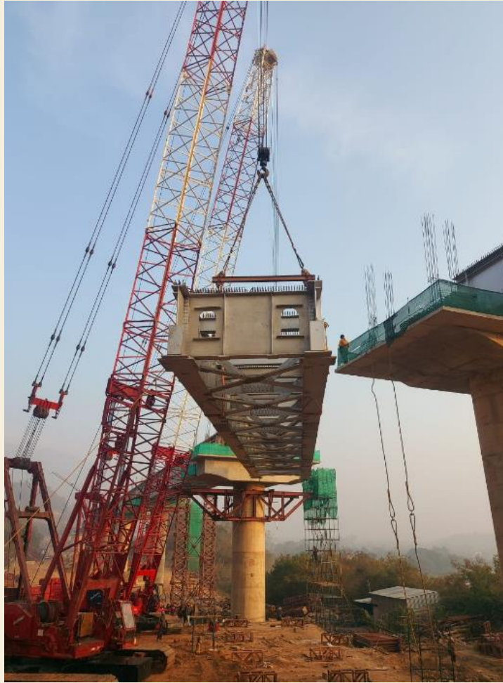
Fig 2: Launching for Span 30.5 m Straight at Bridge-4, RVNL BBB Project, supervised by KRCL Engineers.