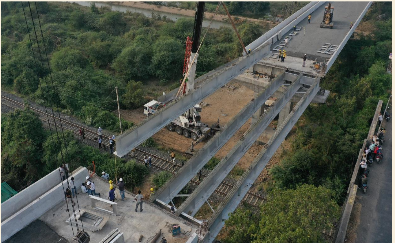
Fig 4: Launching in progress for ROB SMC Project- Saroli