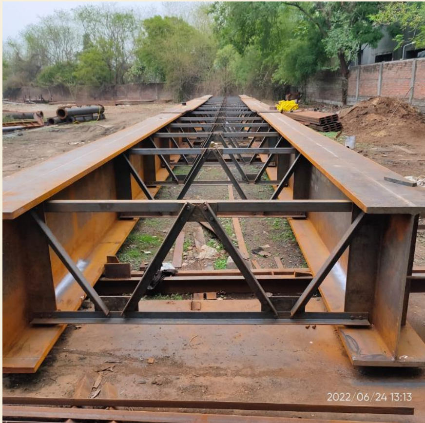
Fig 7: Trial Assembly for FOB Central Railway Daund Manmad Doubling project