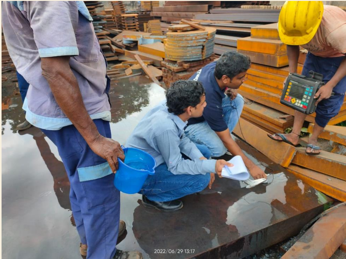
Fig 11: Ultrasonic Testing of Structural Steel Plates in progress