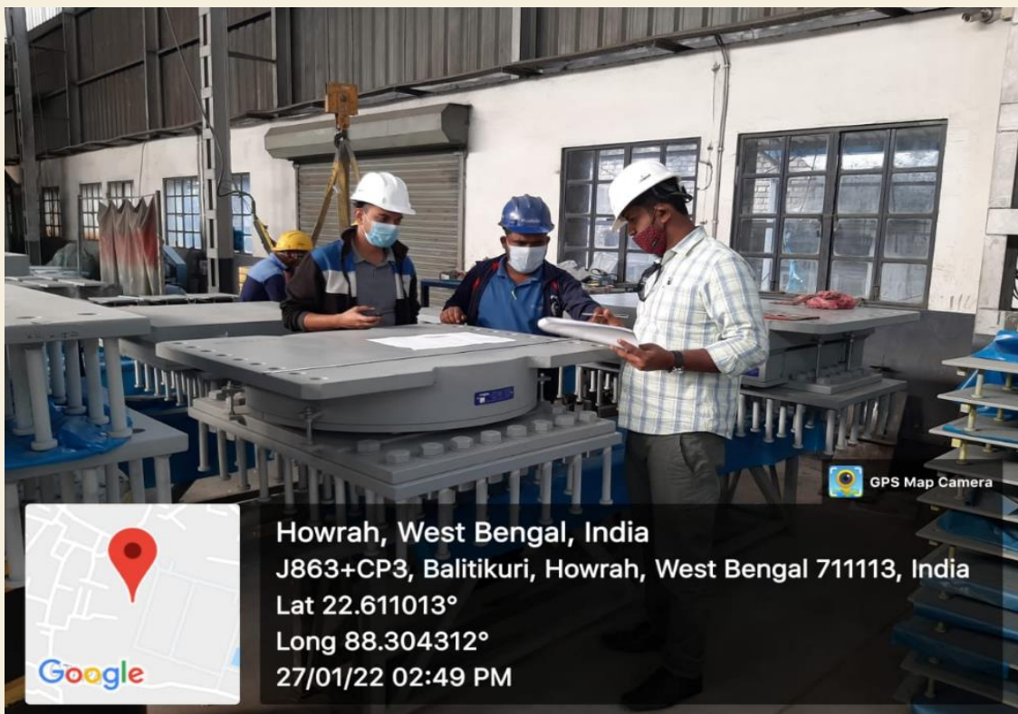
Fig 6: Inspection of Spherical Bearings at M/s Mageba Kolkata for RVNL BBB Project.