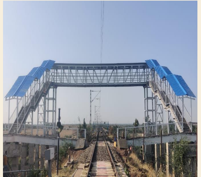
Fig 15: 1x29.54m FOB at for NTPC Kudgi, Karnataka