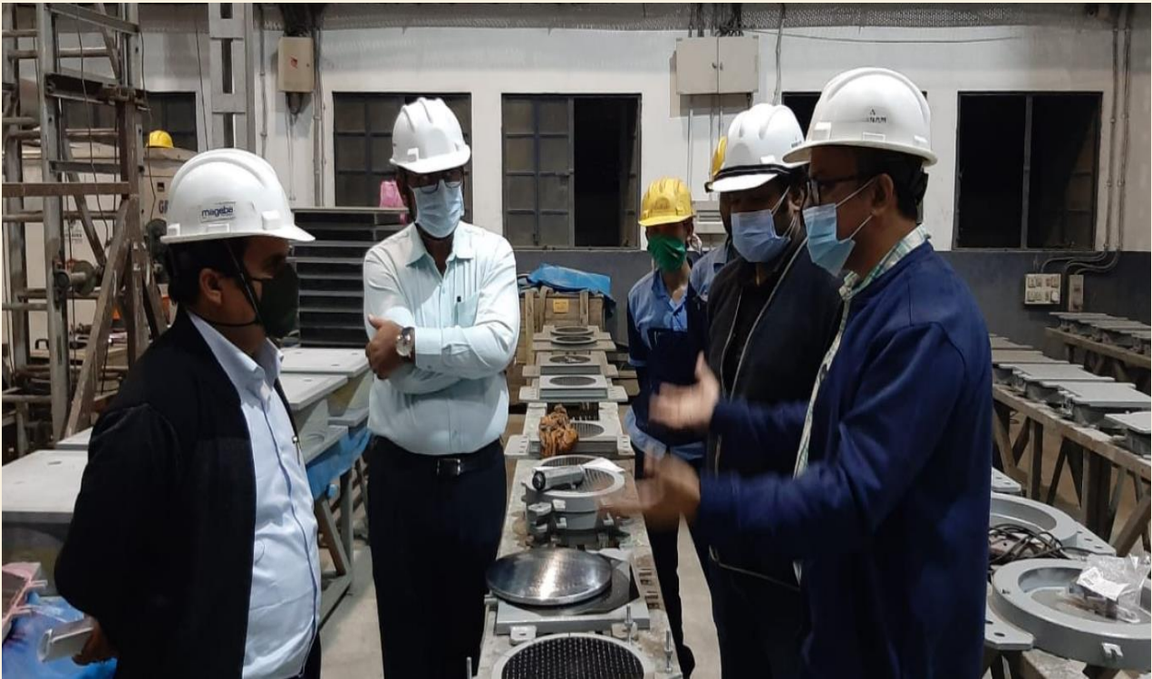
Fig 9: Inspection of Spherical Bearings at M/s Mageba, Kolkata by CPM RVNL & PD RVNL BBB