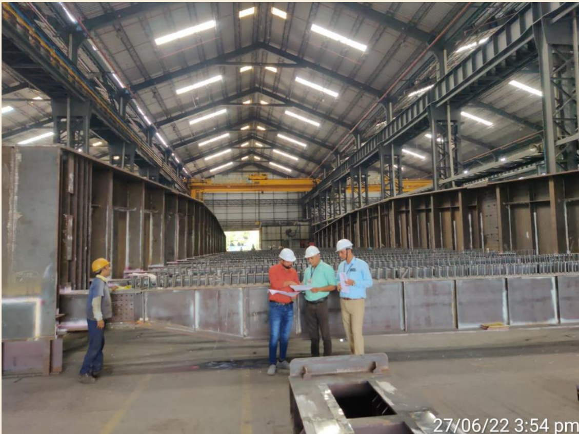
Fig 12: Inspection of Fabrication Works for MMRDA Project at M/s IGPL, Pune