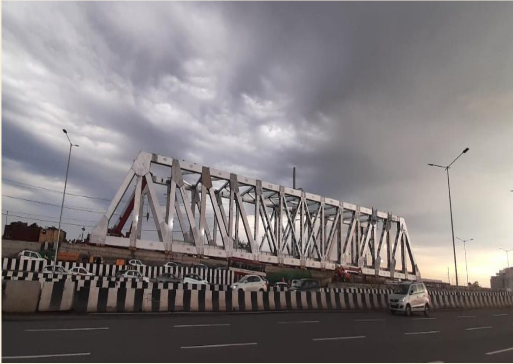
Fig 13: 1X115m span Truss Girder for NHAI Delhi Meerut Expressway Package-II (Completed)