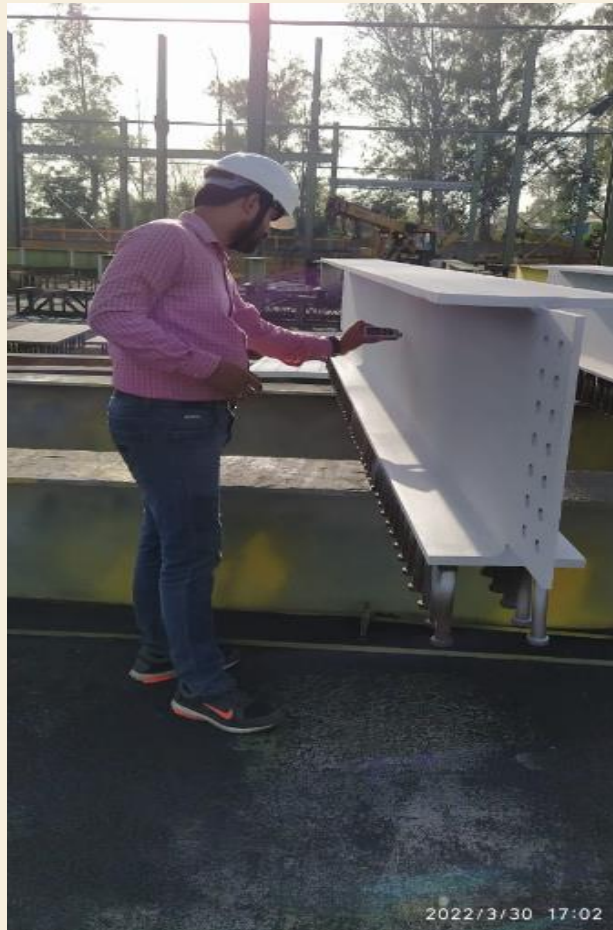
Fig 5: Inspection of Painted Girders