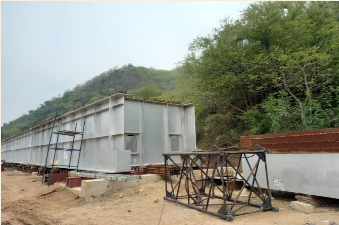
Fig 3: Assembly at RVNL Chandigarh BBB Bridge site