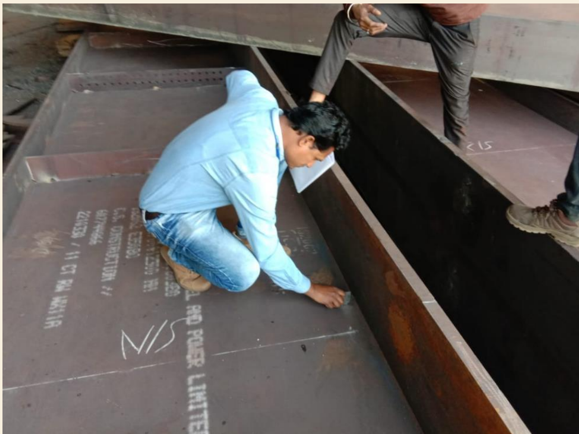
Fig 8: Inspection of Welding for ROB over SEC Railway.