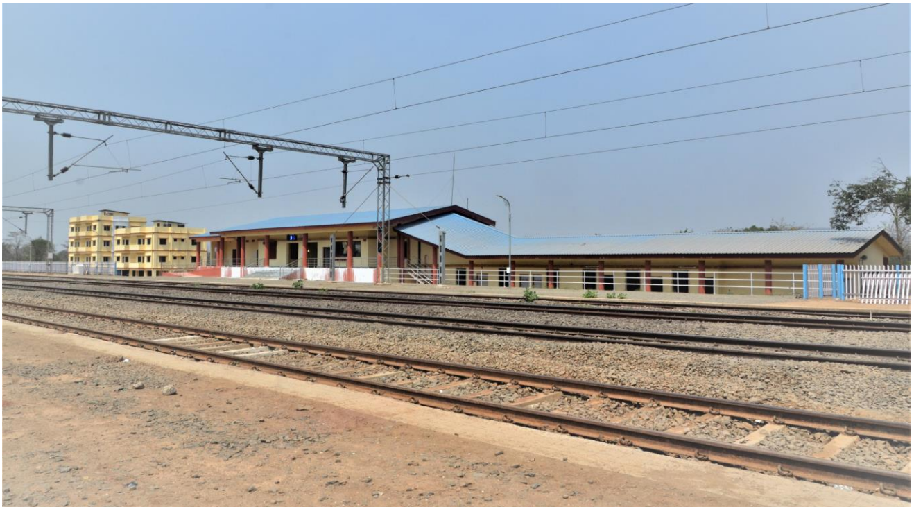
Creation of New Assets - Station at Indapur near Mangaon, Maharashtra