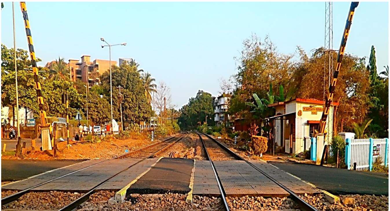
Rubberised Paver Blocks on Level Crossing Gate Road surface