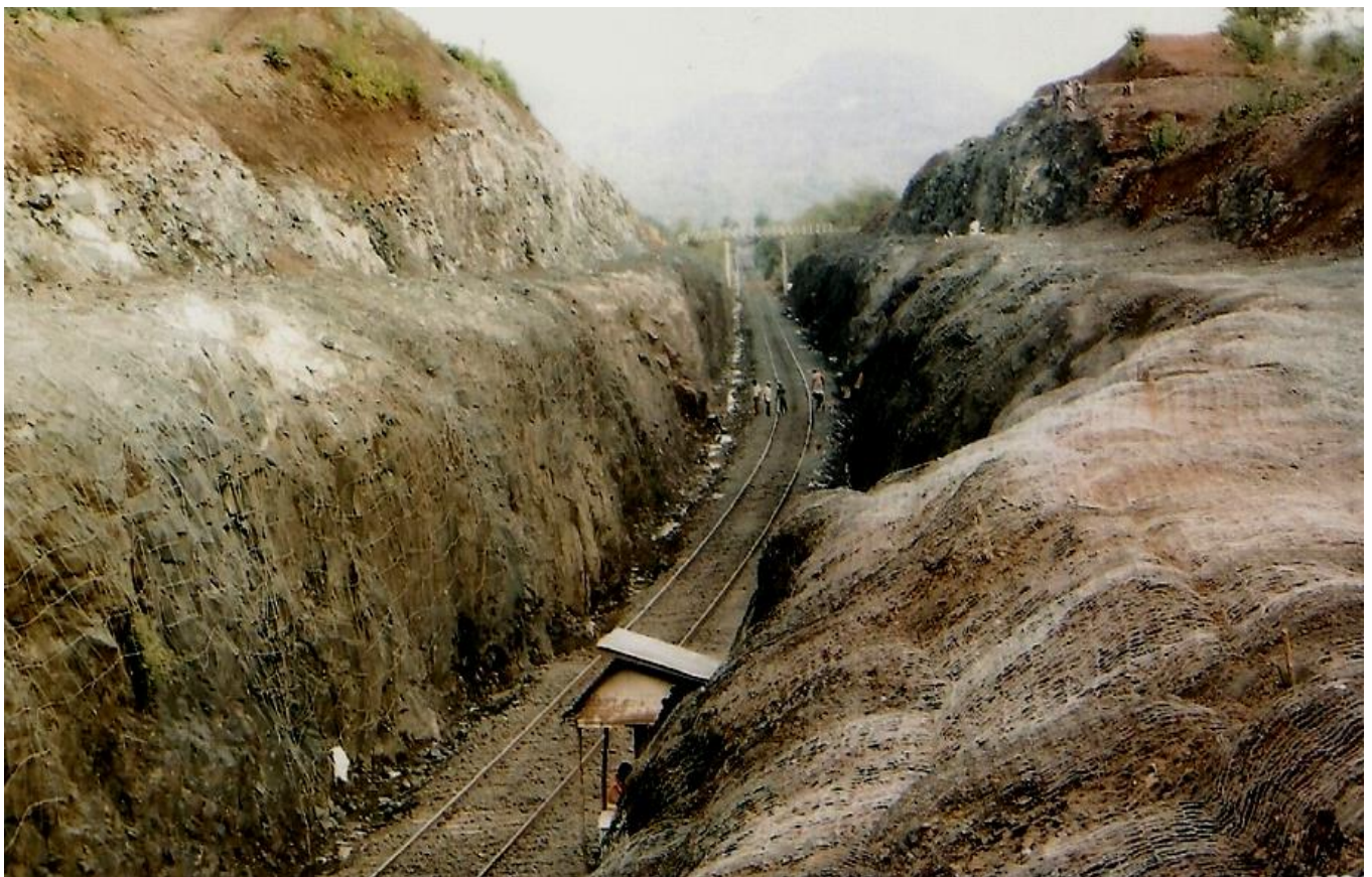
Slope Flattening Work at Rock Cutting