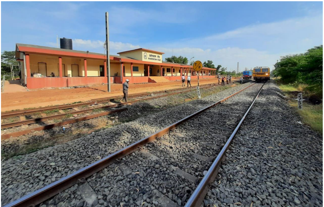
Creation of New Assets - Station at Kharepatan Road near Rajapur, Maharashtra