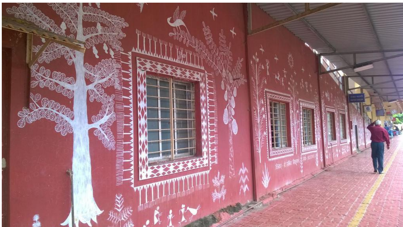
Paintings on Ratnagiri Station Building Walls