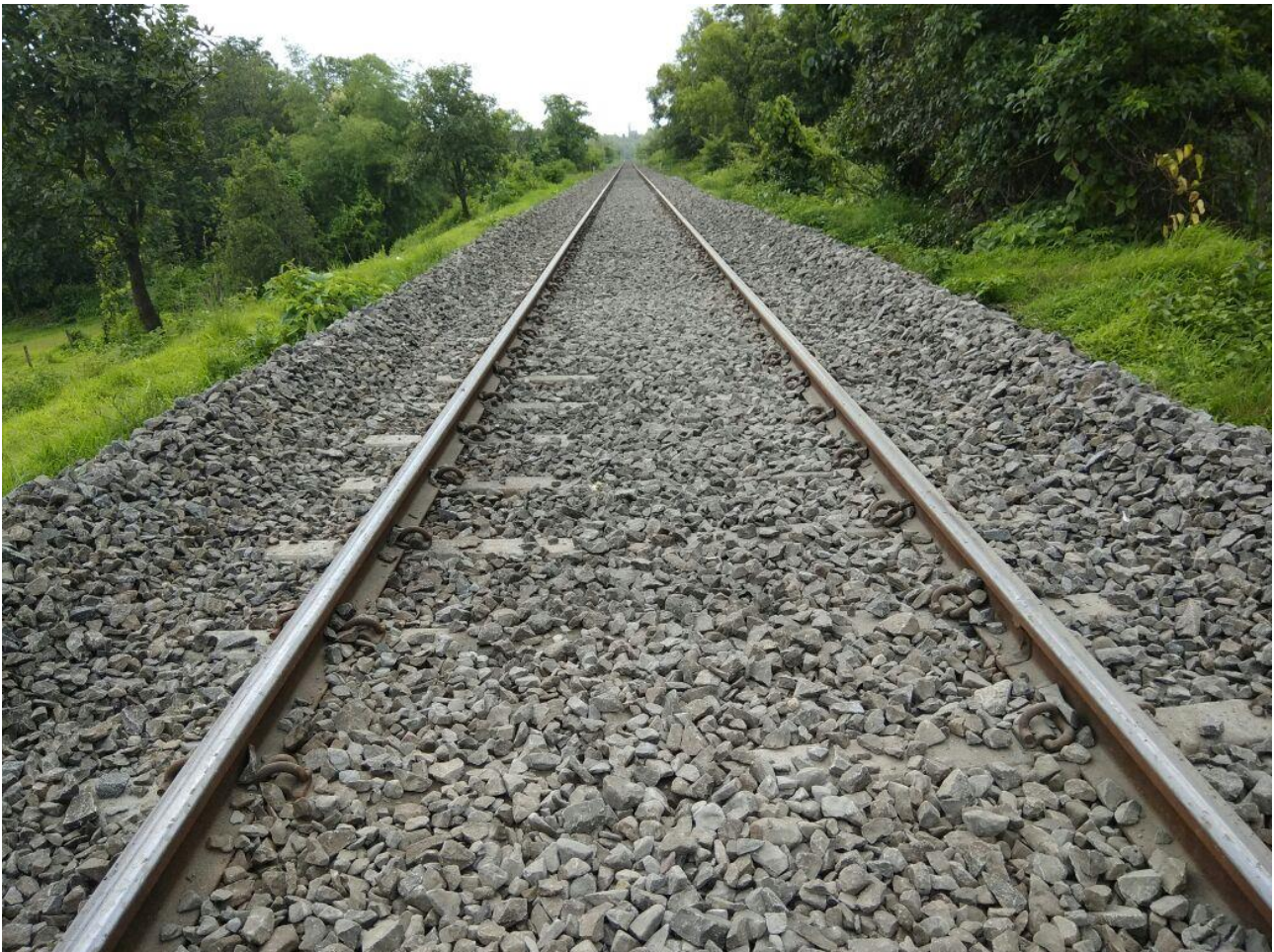
Working of Track Machines (Ballast Regulating Machine)