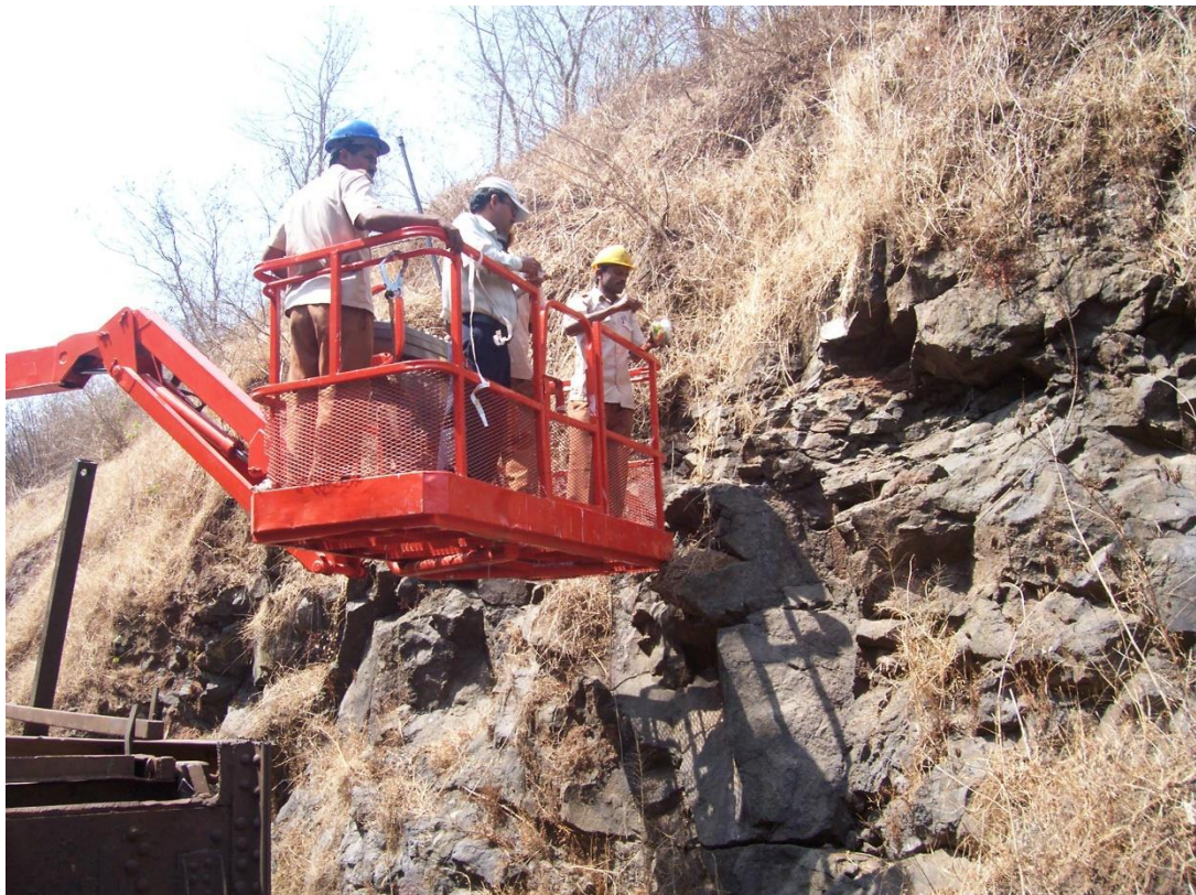
Inspection and Loose scaling in Rock Cuttings using Boom List