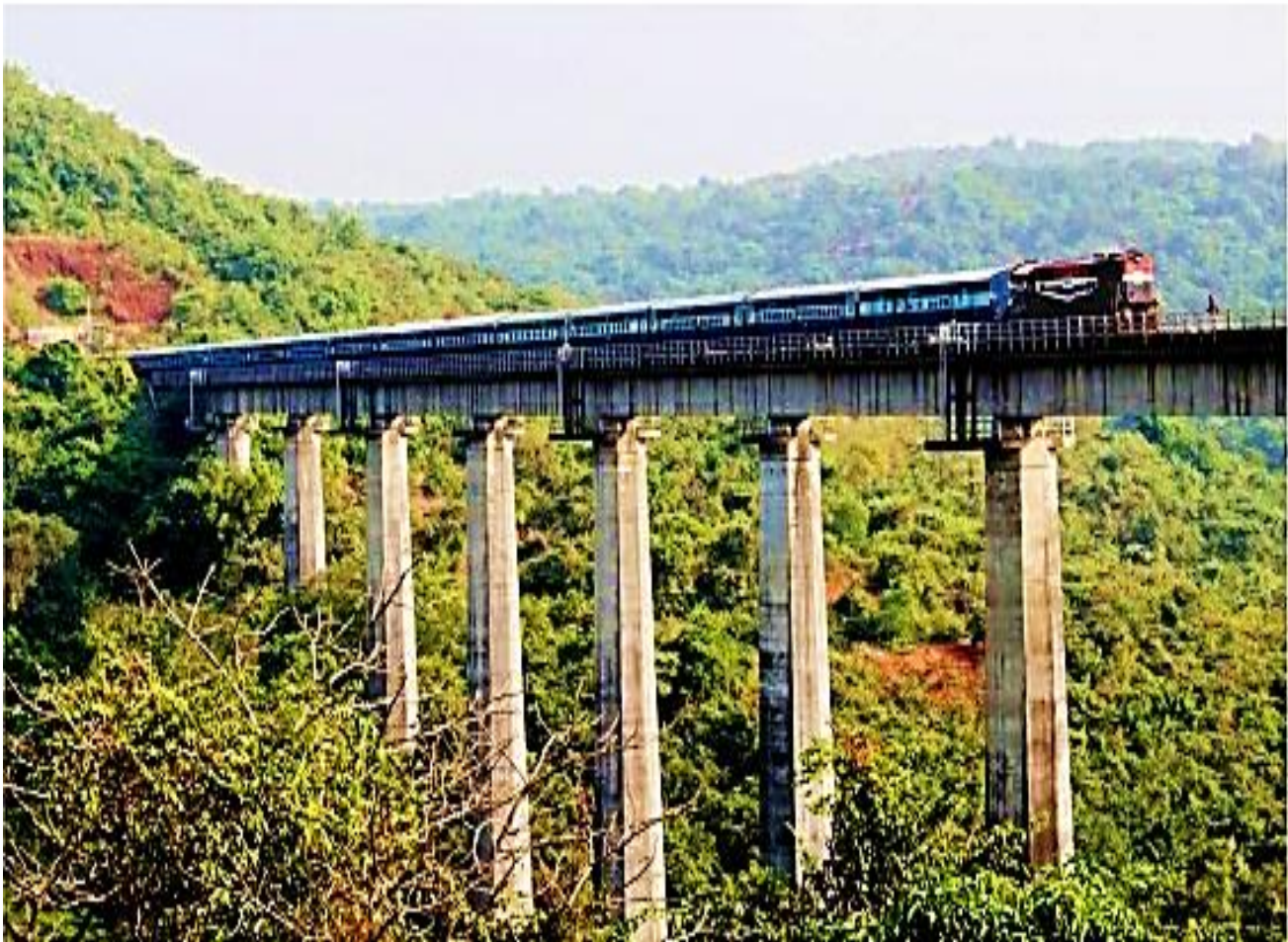
Panval Viaduct- Tallest Bridge on Konkan railway