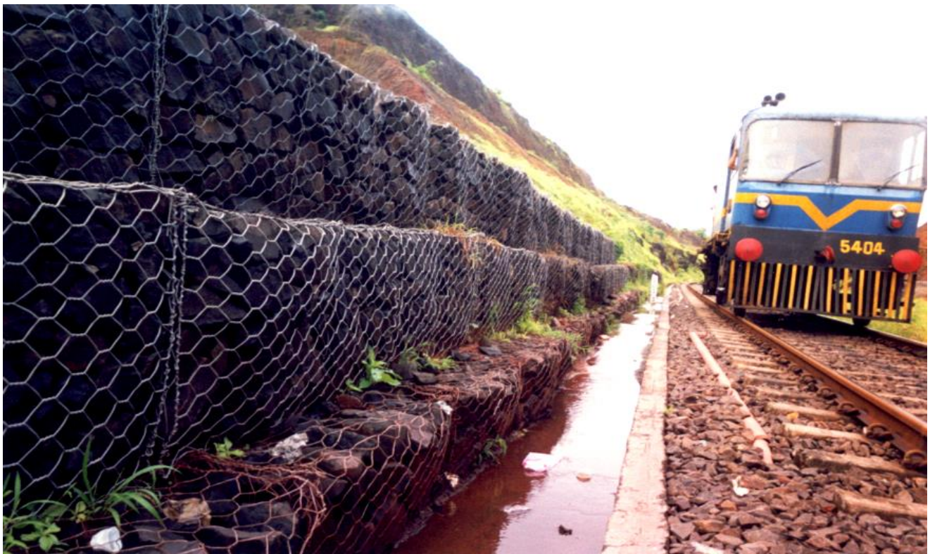
GABION RETAINING WALL