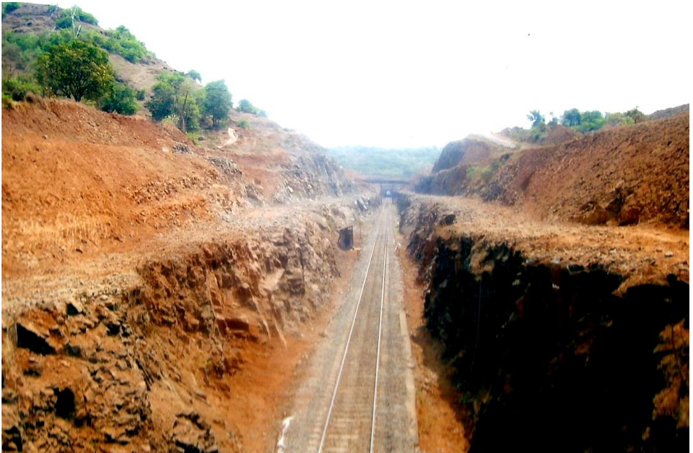
Slope Flattening Work at Rock Cutting (Before and After Safety Work)