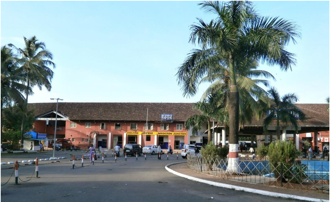
Madgaon Station, Goa