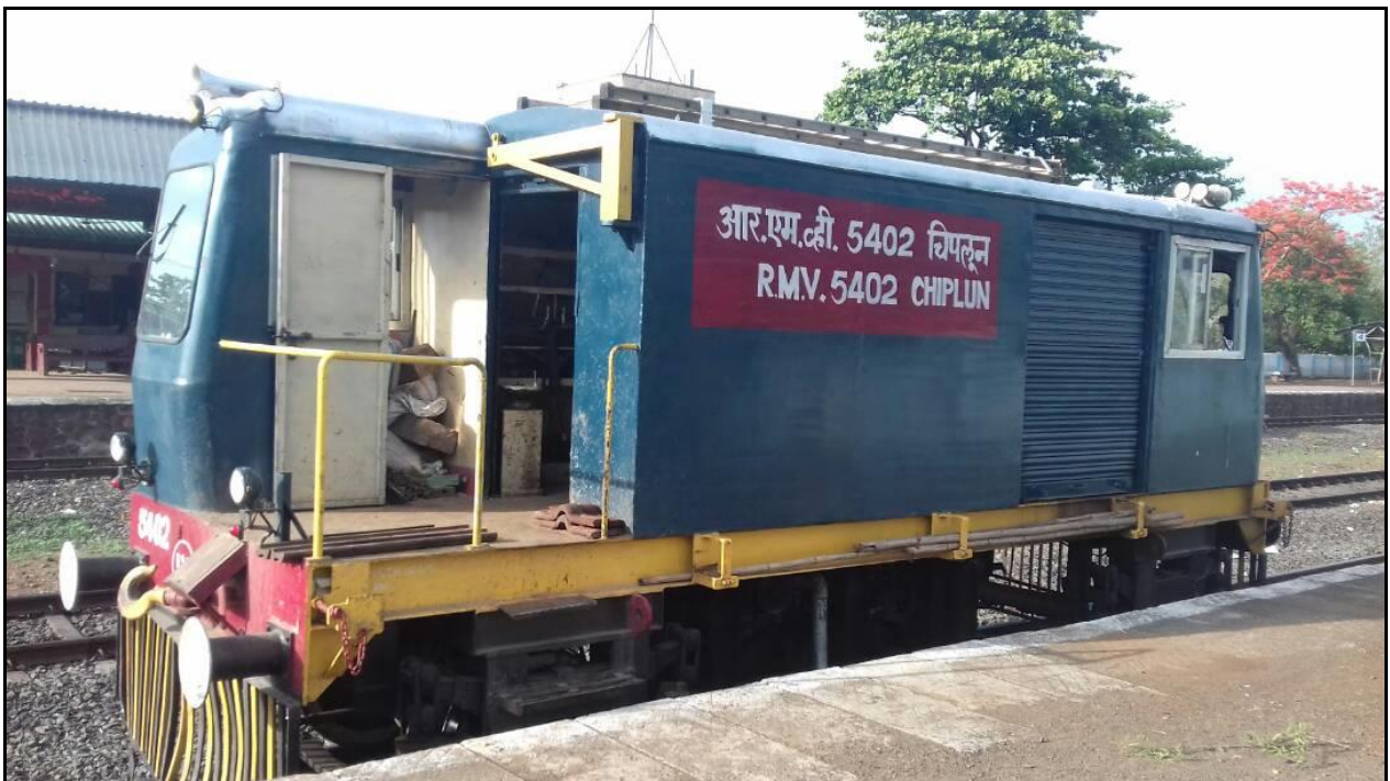
Rail Maintenance Van