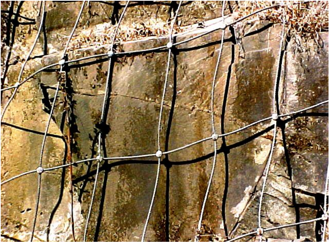
High Strength Boulder Net (Close View)