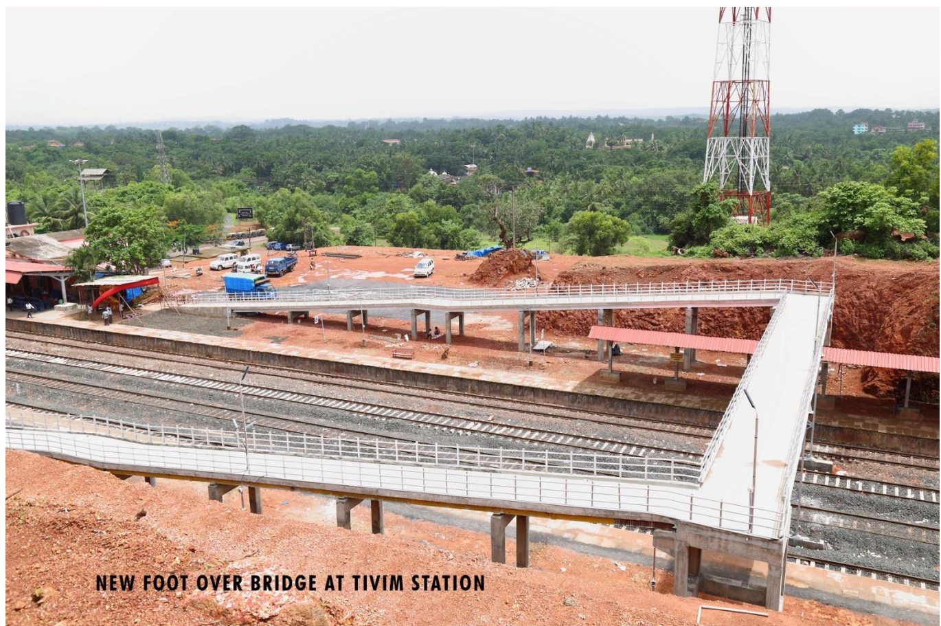
Creation of New Assets – New Loop Lines, Platforms and Foot Over Bridge (FOB) at Thivim, Goa