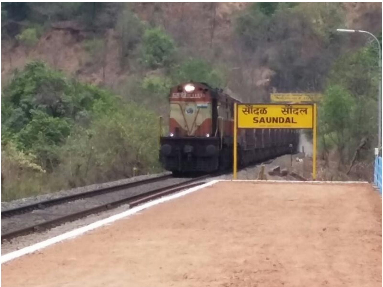
Creation of New Assets - Halt Station at Saundal on 22m high Embankment near Rajapur, Maharashtra