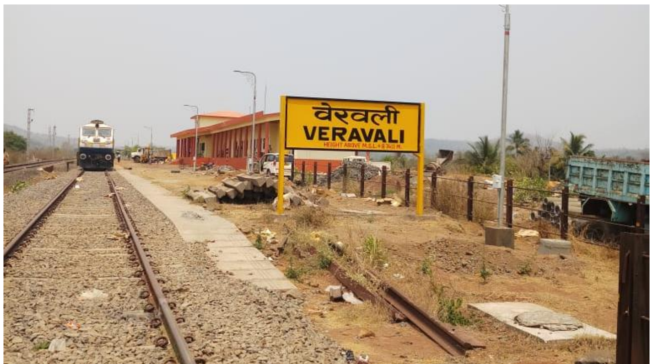
Creation of New Assets - Station at Veravali near Vilavade, Maharashtra