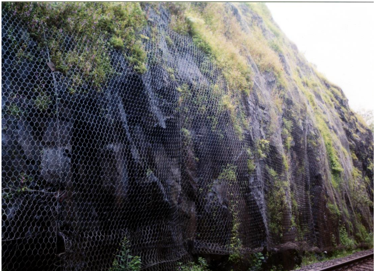
Medium Strength Boulder Net at Rock Cutting