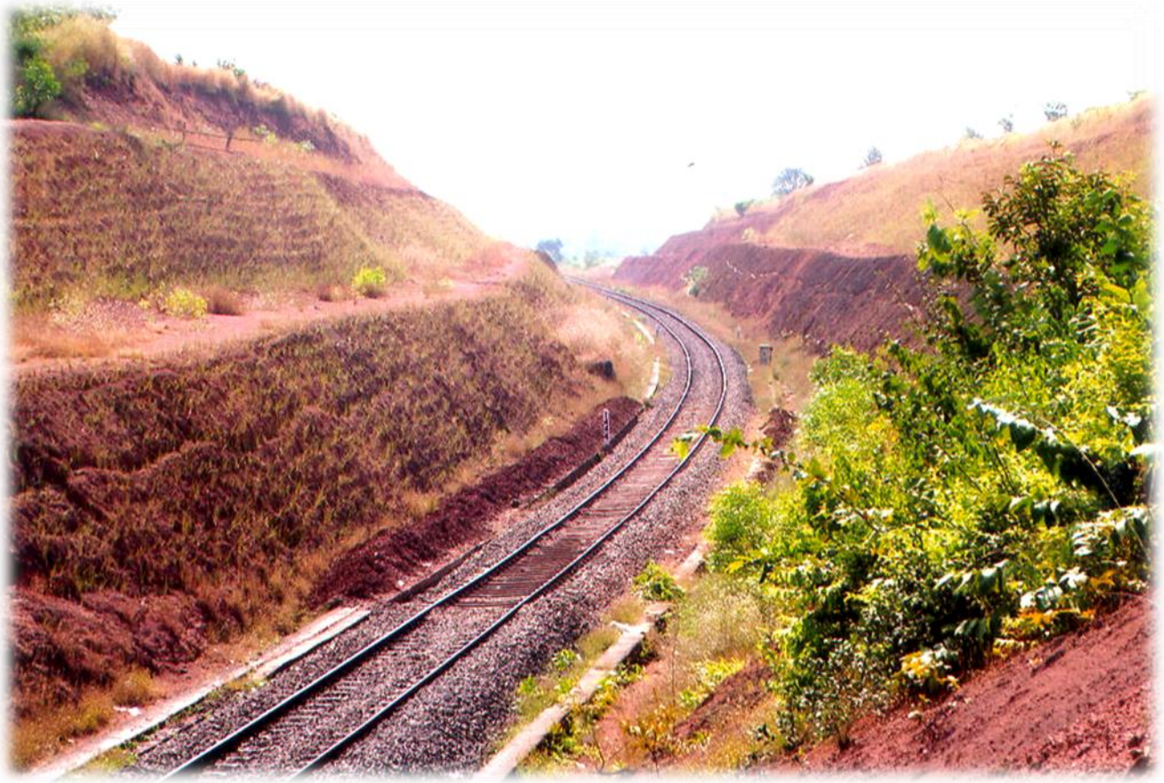
Vettiver Plantation on Soil Cutting Slopes for prevention of Soil erosion