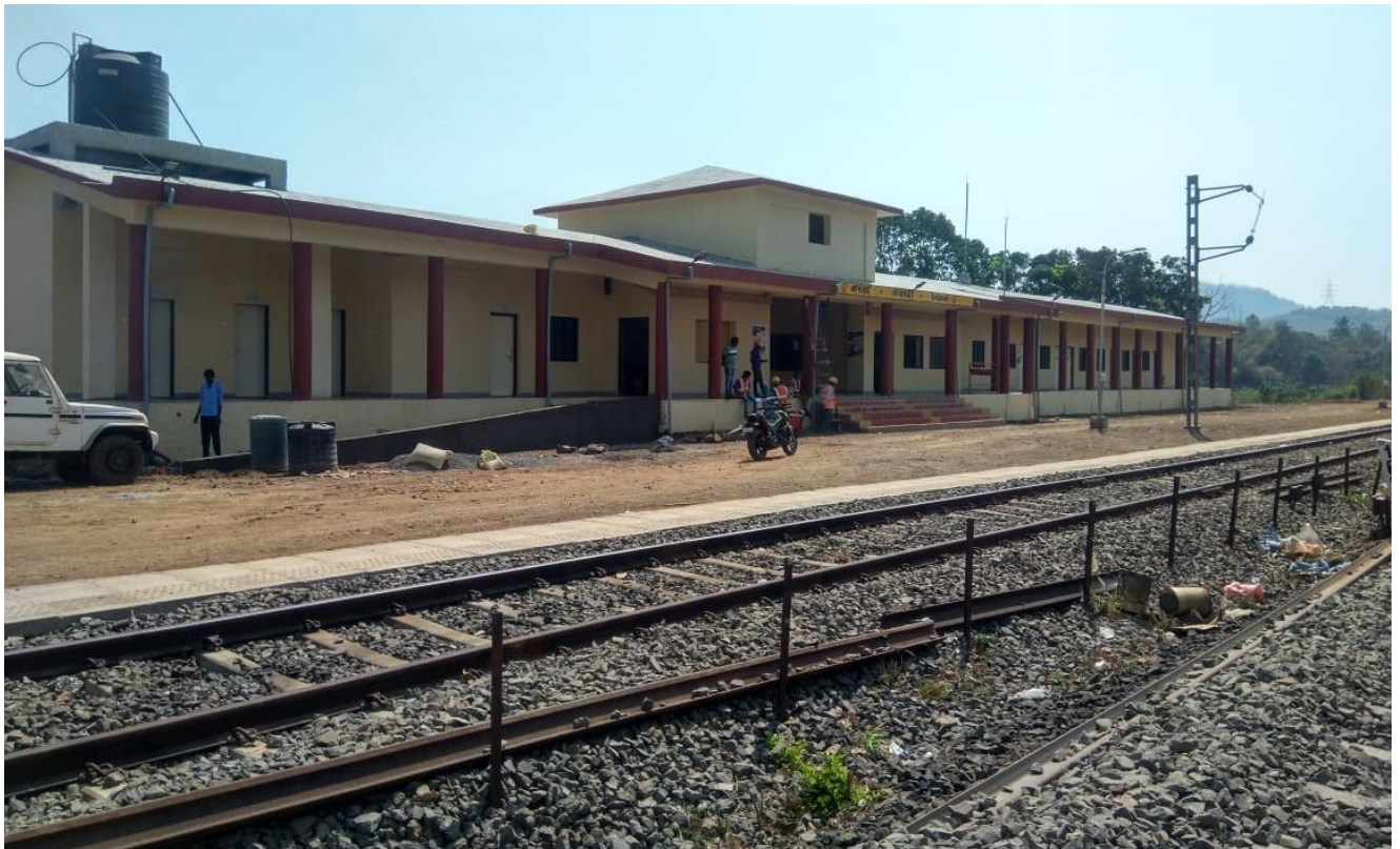
Creation of New Assets - Station at Kadavai near Sangmeshwar, Maharashtra