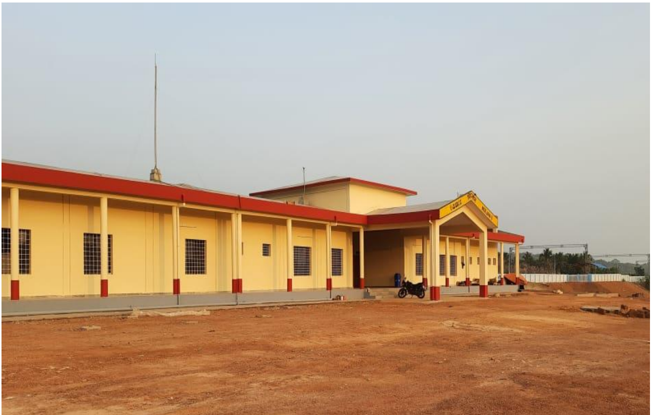
Creation of New Assets - Station at Mirjan near Kumta, Karnataka