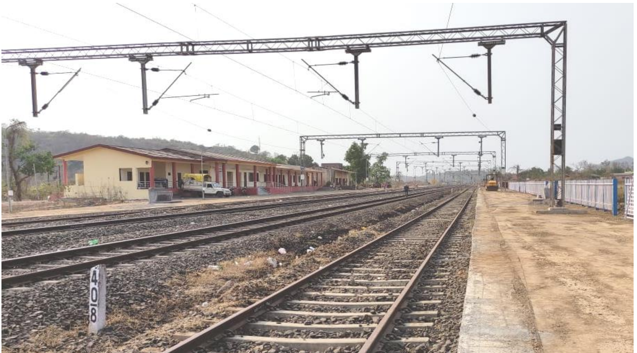
Creation of New Assets - Station at Goregaon Road near Veer, Maharashtra