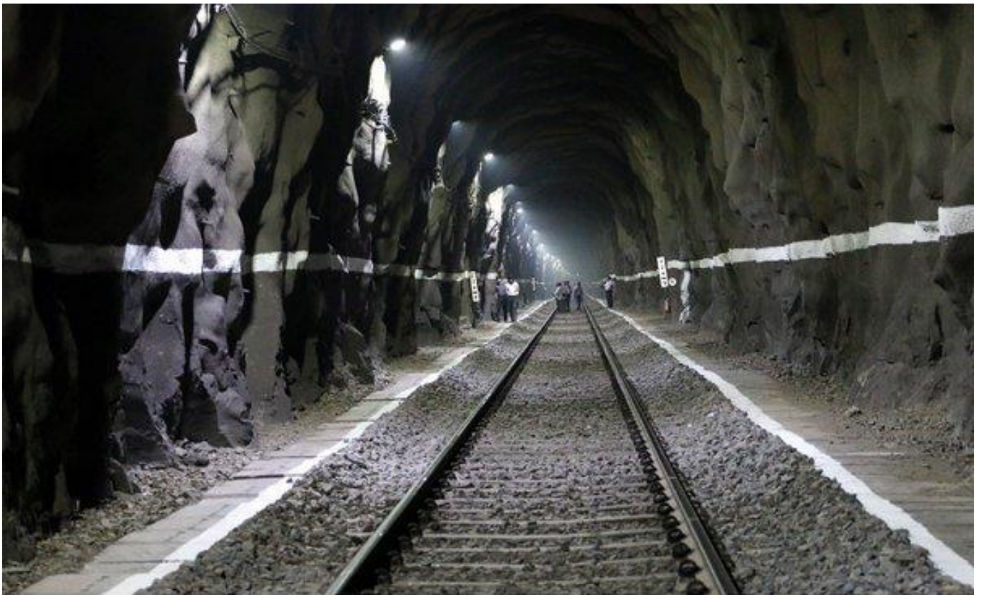
Permanent support in Tunnels - Rock bolts and Shotcreting