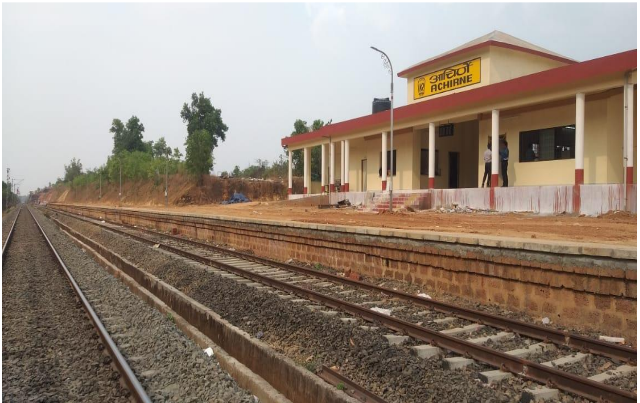
Creation of New Assets - Station at Achirne near Nandgaon Road, Maharashtra