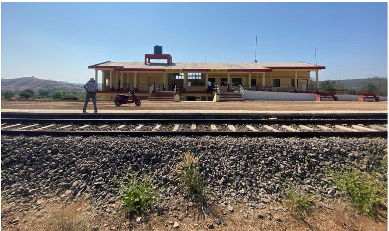
Creation of New Assets - Station at Sape-Wamane near Veer, Maharashtra