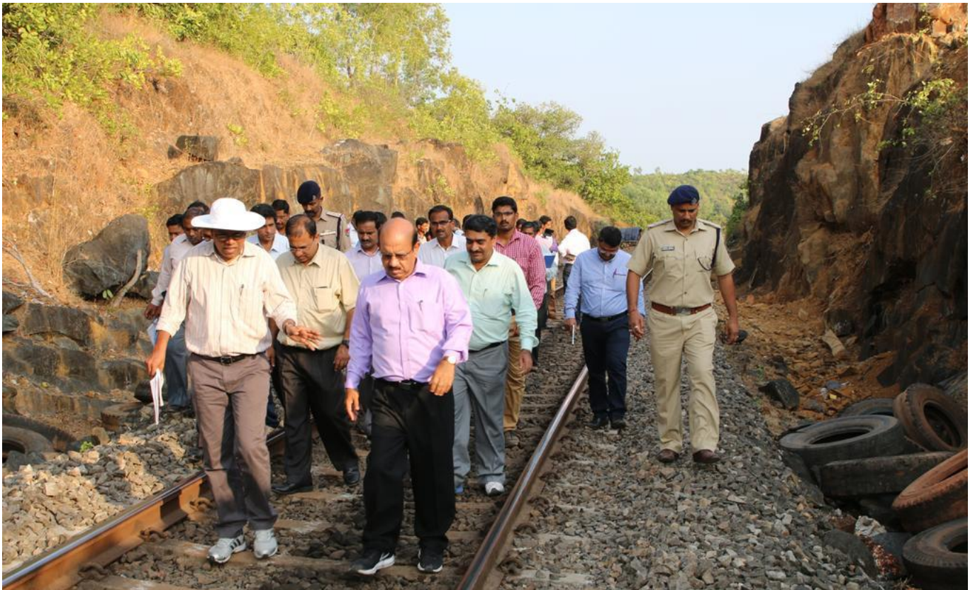
Pre-monsoon Annual Inspection of Section by Commissioner of Railway Safety with CMD, Directors, HODs and other KR Officials