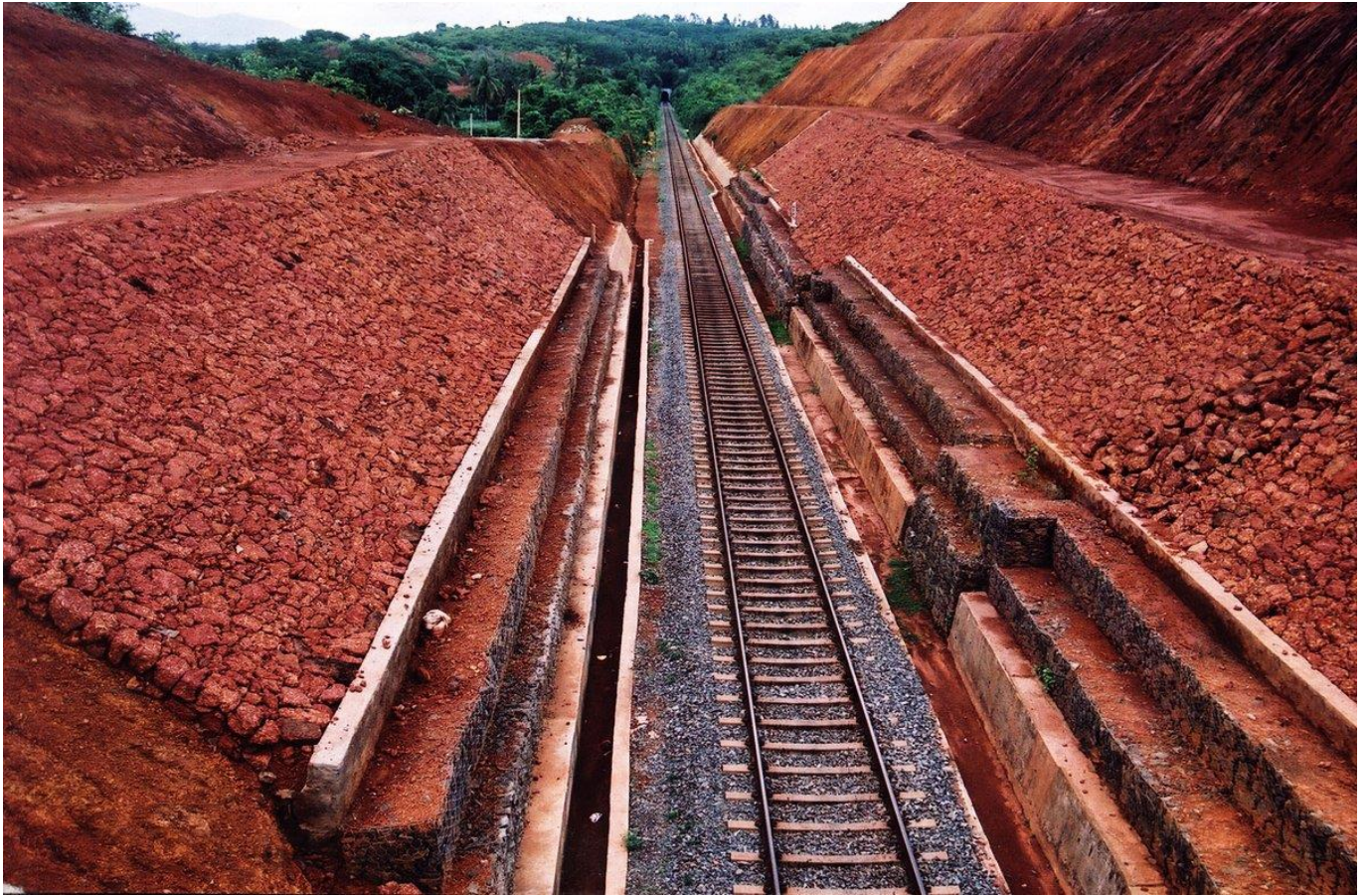
Flattening of Cutting Sides and Protective Works in Soil Cuttings