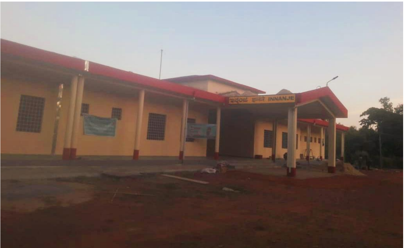
Creation of New Assets - Station at Innanje near Udupi, Karnataka