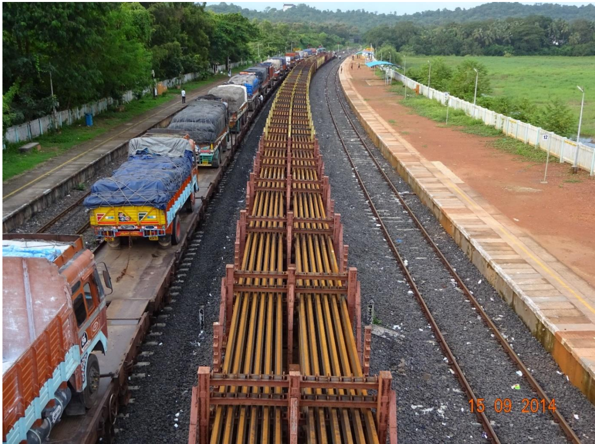
New 260m Rail Panels for Casual Rail Renewal