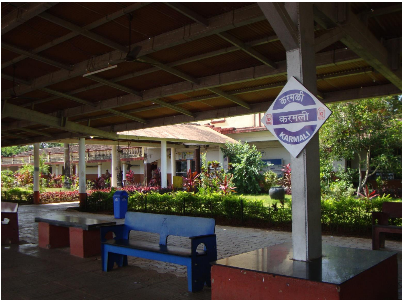
Karmali Station, Goa