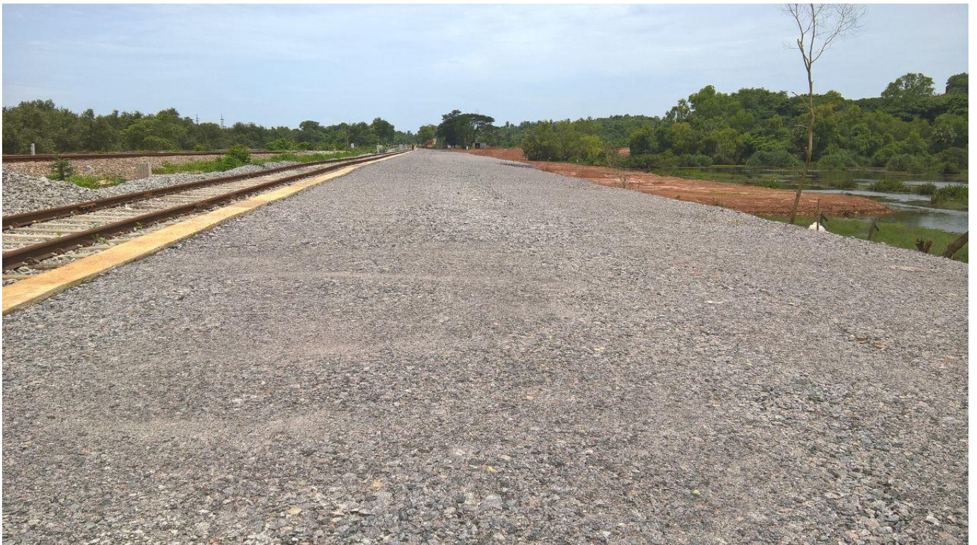
Creation of New Assets – Half-rake length Siding at Thokur Yard near Mangalore, Karnataka