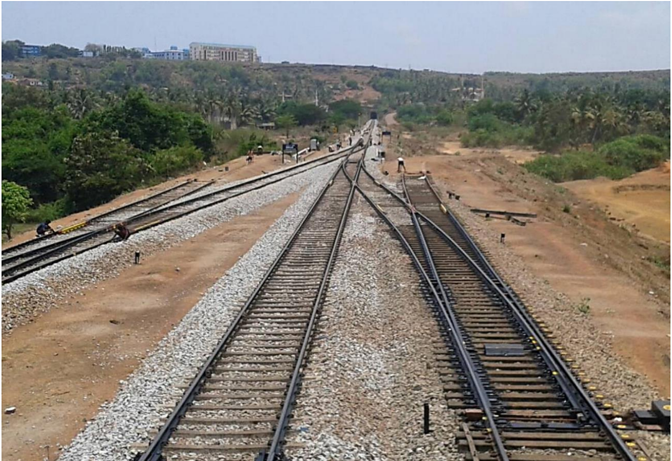
Thick Web Switches in Turn-outs