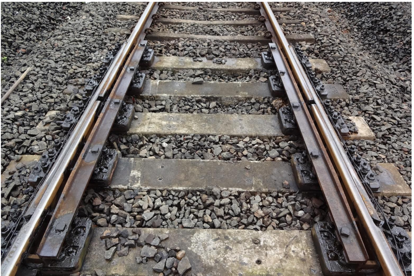
Improved Switch Expansion Joint