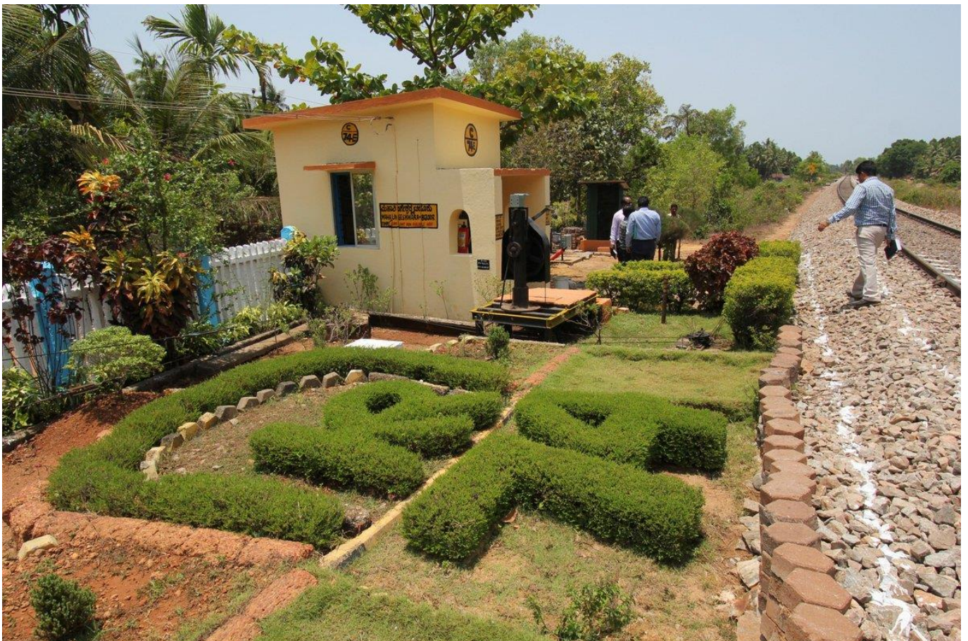
An initiative by Gate Keeper at Level Crossing Gate – 74 near Bijoor, Udupi District