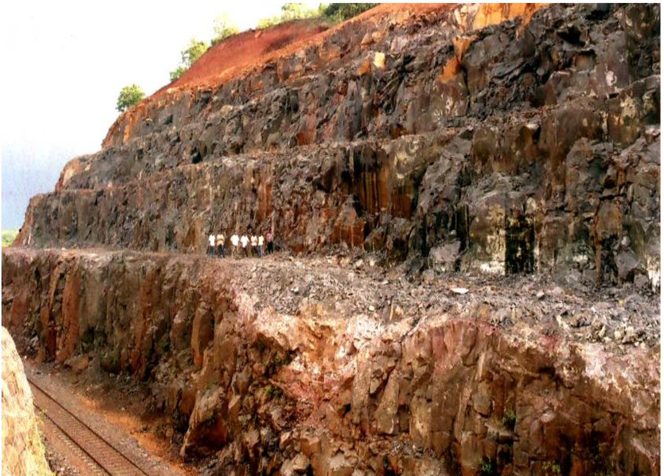
Slope Flattening Work at Rock Cutting (Before and After Safety Work)