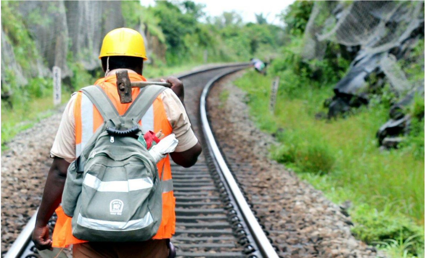
Trackman on Patrolling Duty