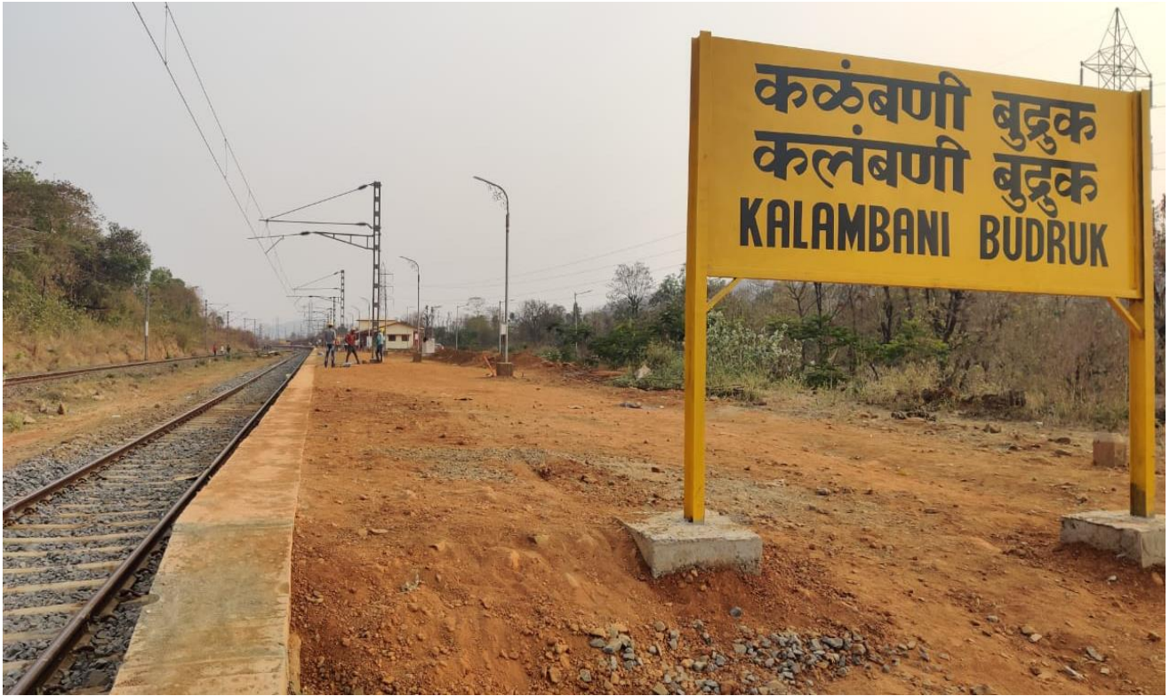
Creation of New Assets - Station at Kalambani Budruk near Khed, Maharashtra