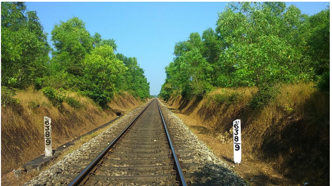
Green Railway – General view of Track