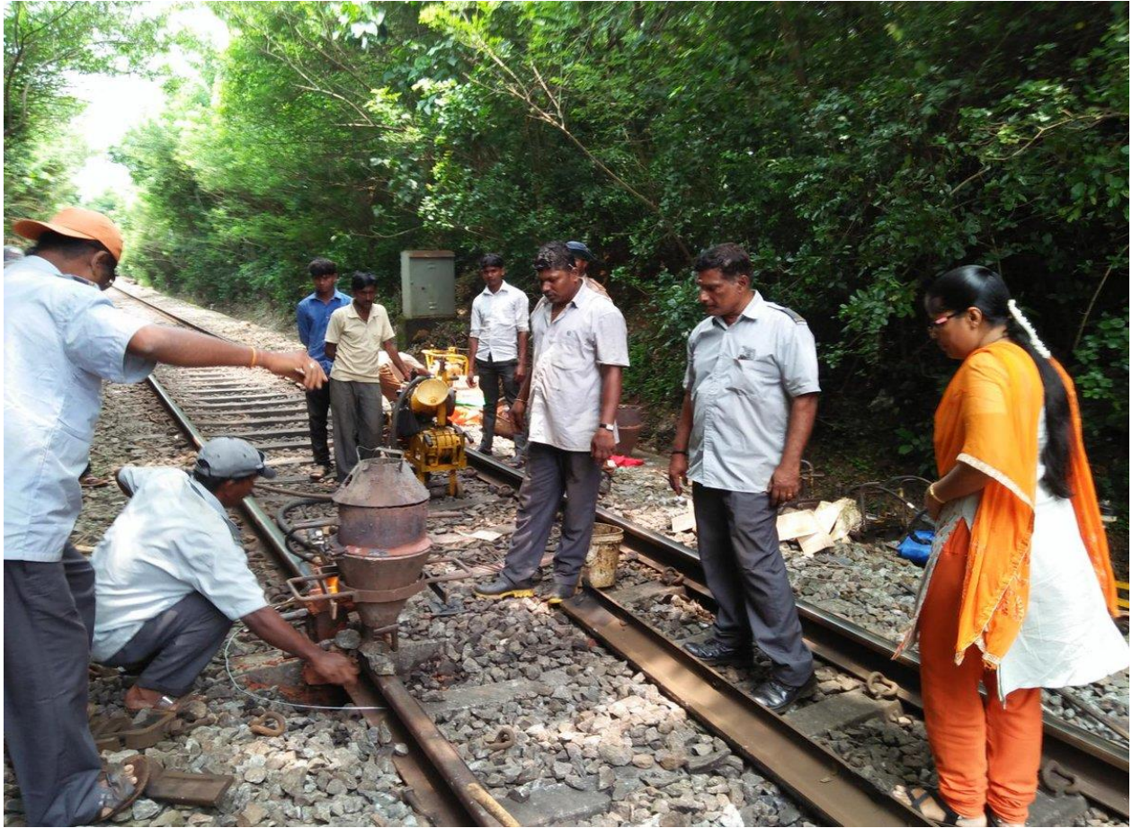
Alumino- Thermic Welding of Rails