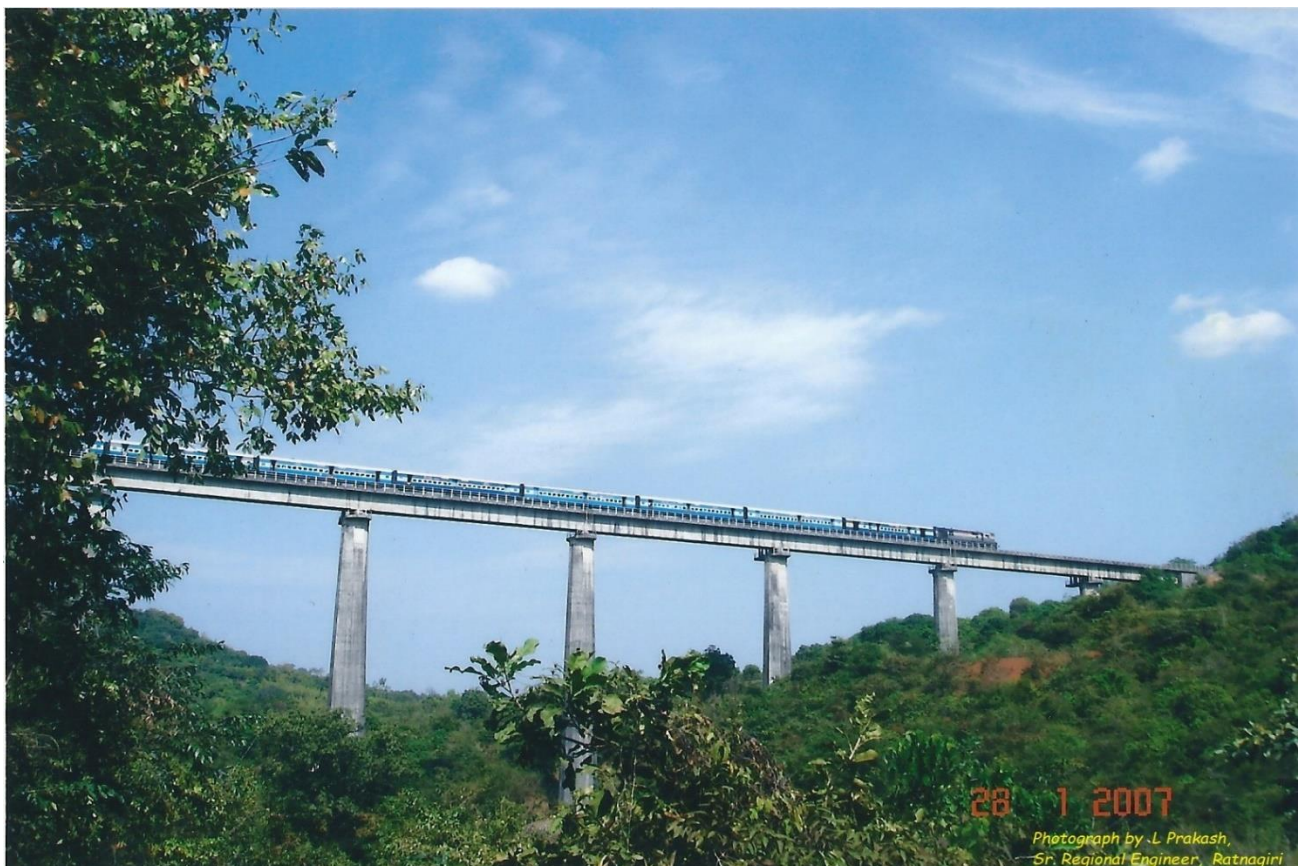
Panval Viaduct- Tallest Bridge on Konkan railway