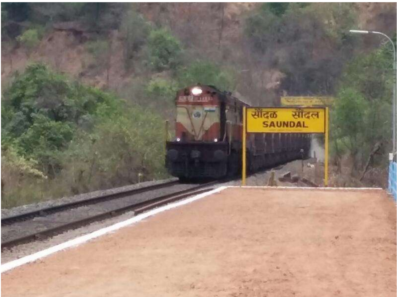
Creation of New Assets - Halt Station at Saundal on 22m high Embankment near Rajapur, Maharashtra