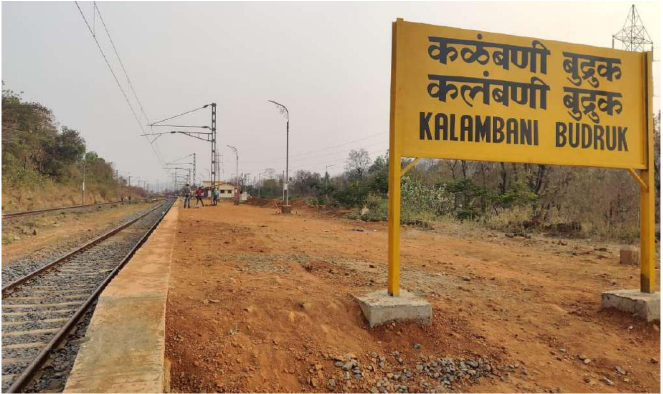
Creation of New Assets - Station at Kalambani Budruk near Khed, Maharashtra