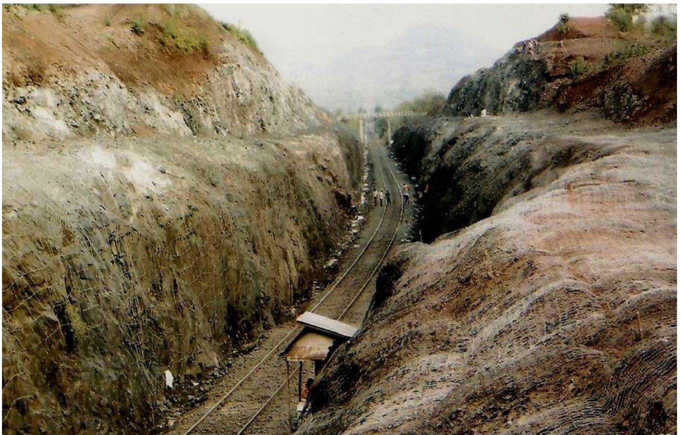
Slope Flattening Work at Rock Cutting