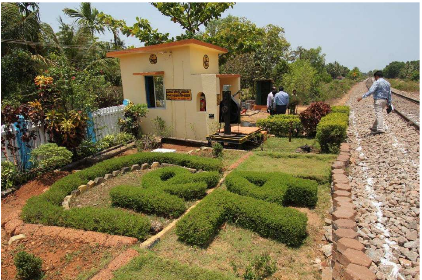
An initiative by Gate Keeper at Level Crossing Gate – 74 near Bijoor, Udupi District