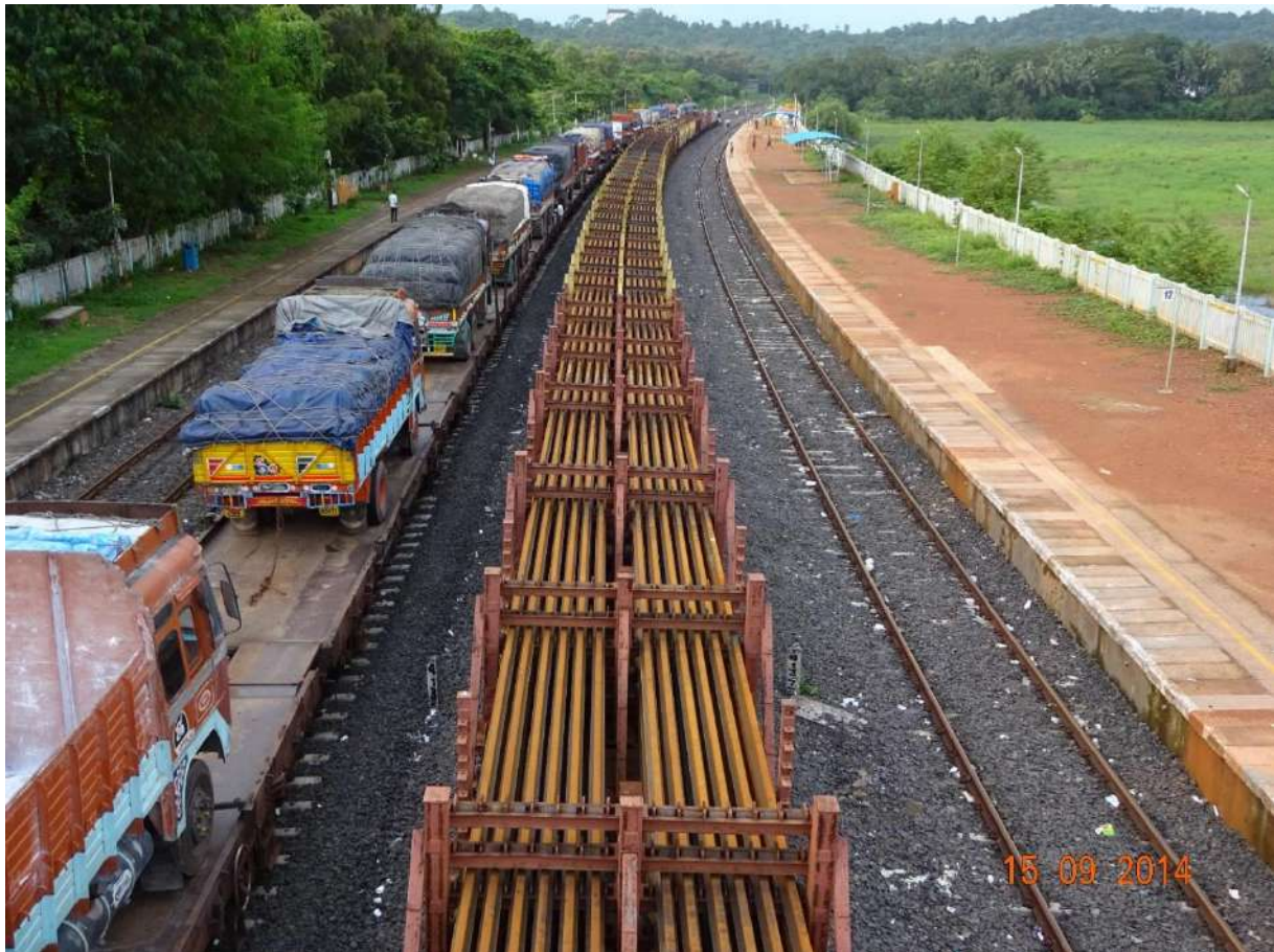
New 260m Rail Panels for Casual Rail Renewal