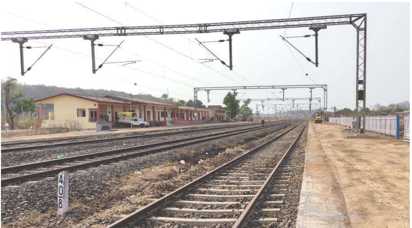
Creation of New Assets - Station at Goregaon Road near Veer, Maharashtra