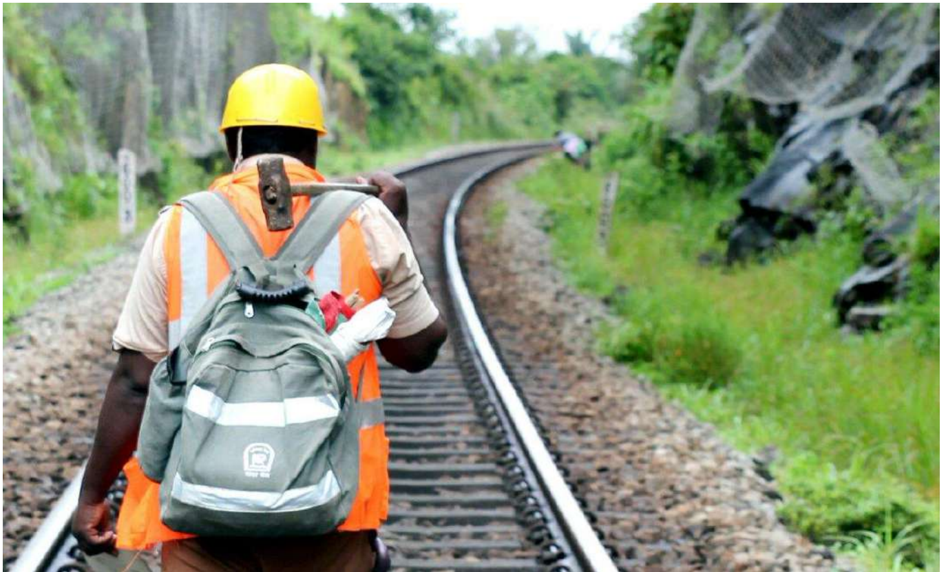
Trackman on Patrolling Duty