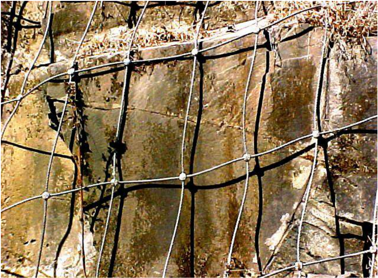
High Strength Boulder Net (Close View)