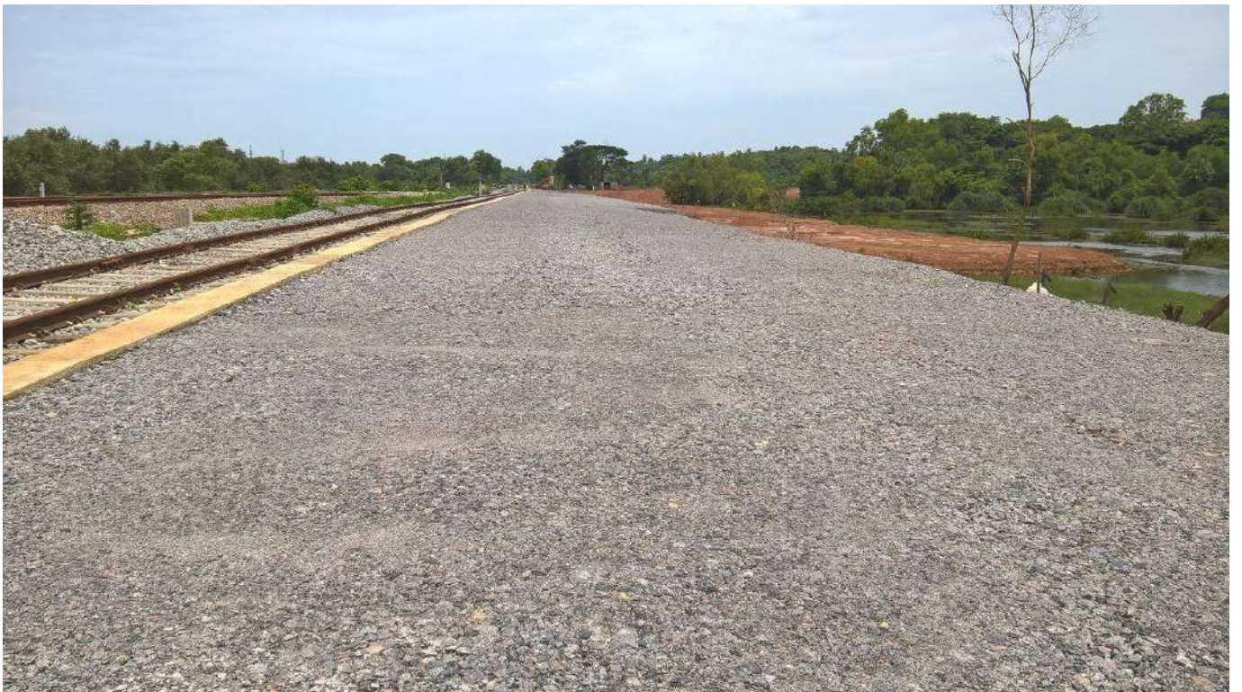
Creation of New Assets – Half-rake length Siding at Thokur Yard near Mangalore, Karnataka