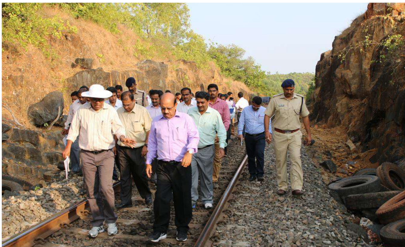
Pre-monsoon Annual Inspection of Section by Commissioner of Railway Safety with CMD, Directors, HODs and other KR Officials