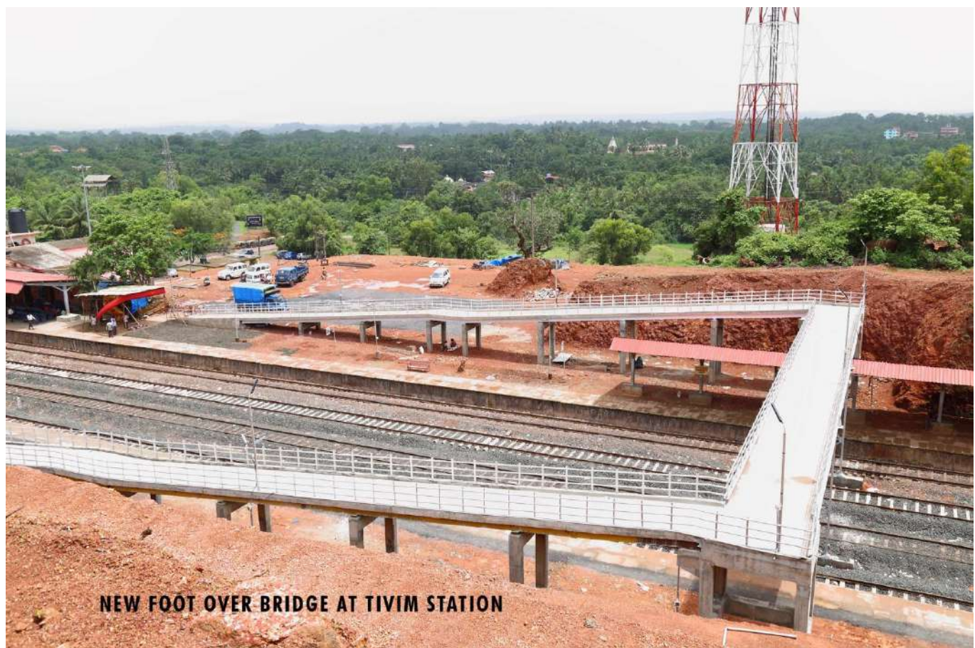
Creation of New Assets – New Loop Lines, Platforms and Foot Over Bridge (FOB) at Thivim, Goa