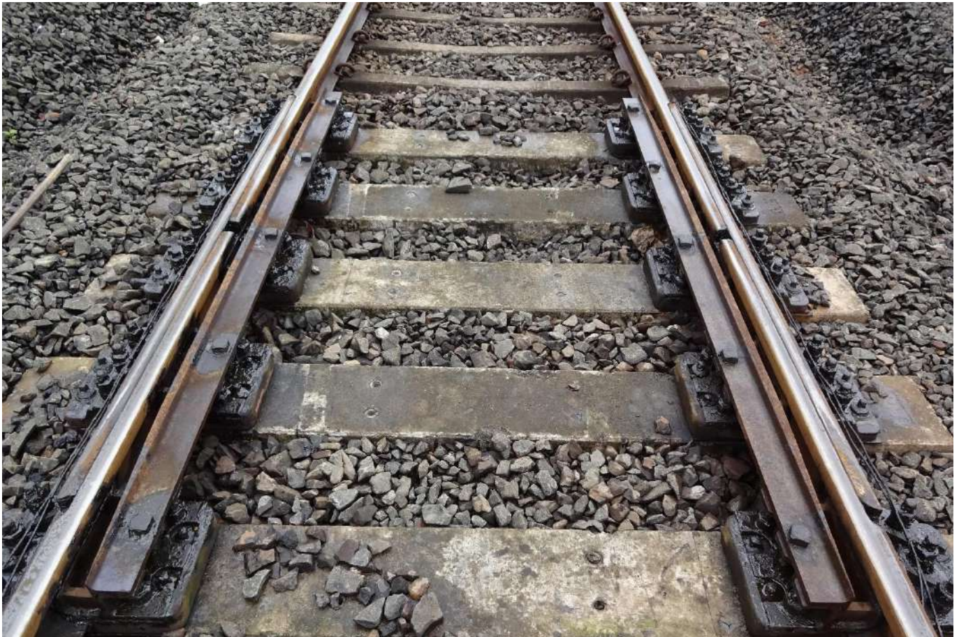
Improved Switch Expansion Joint