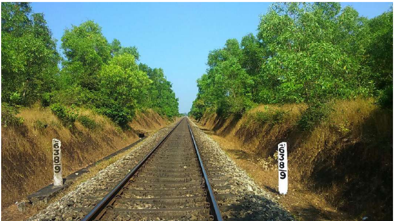
Green Railway – General view of Track