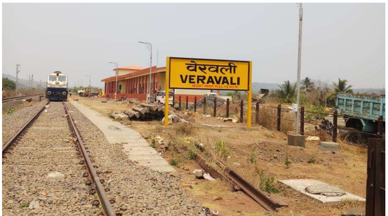
Creation of New Assets - Station at Veravali near Vilavade, Maharashtra