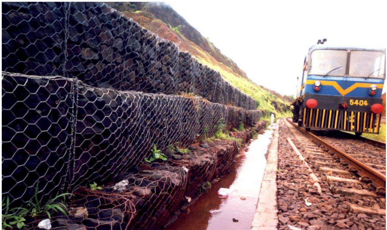
GABION RETAINING WALL