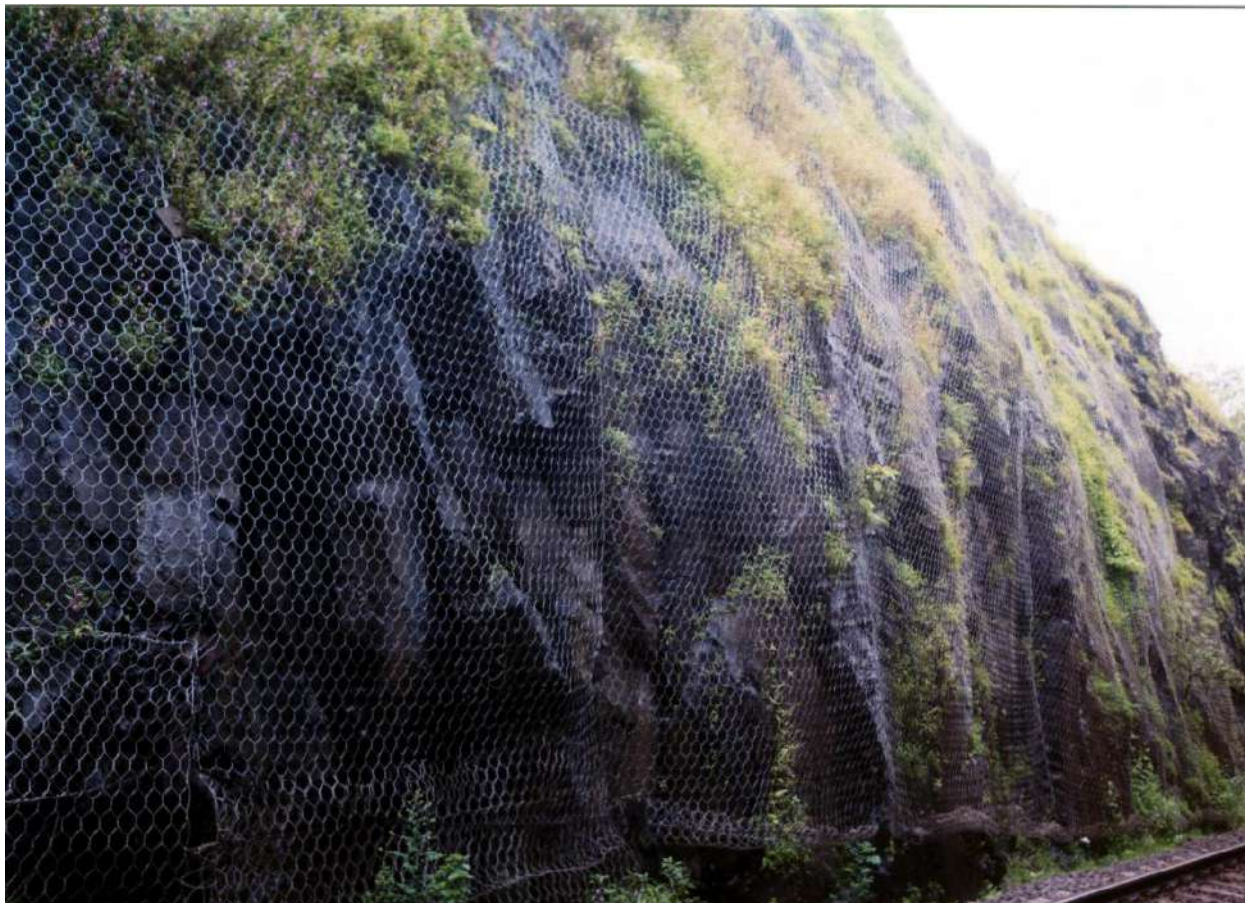
Medium Strength Boulder Net at Rock Cutting