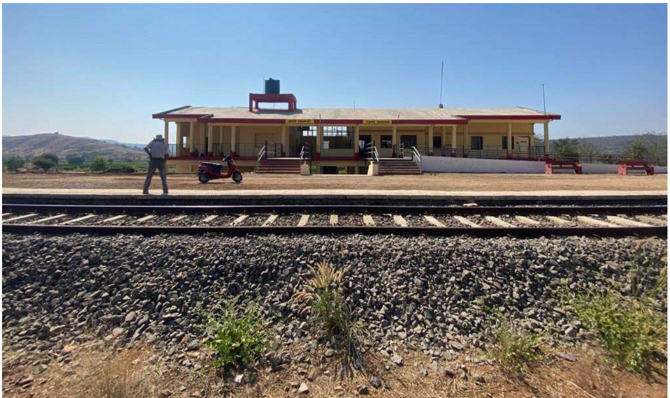
Creation of New Assets - Station at Sape-Wamane near Veer, Maharashtra