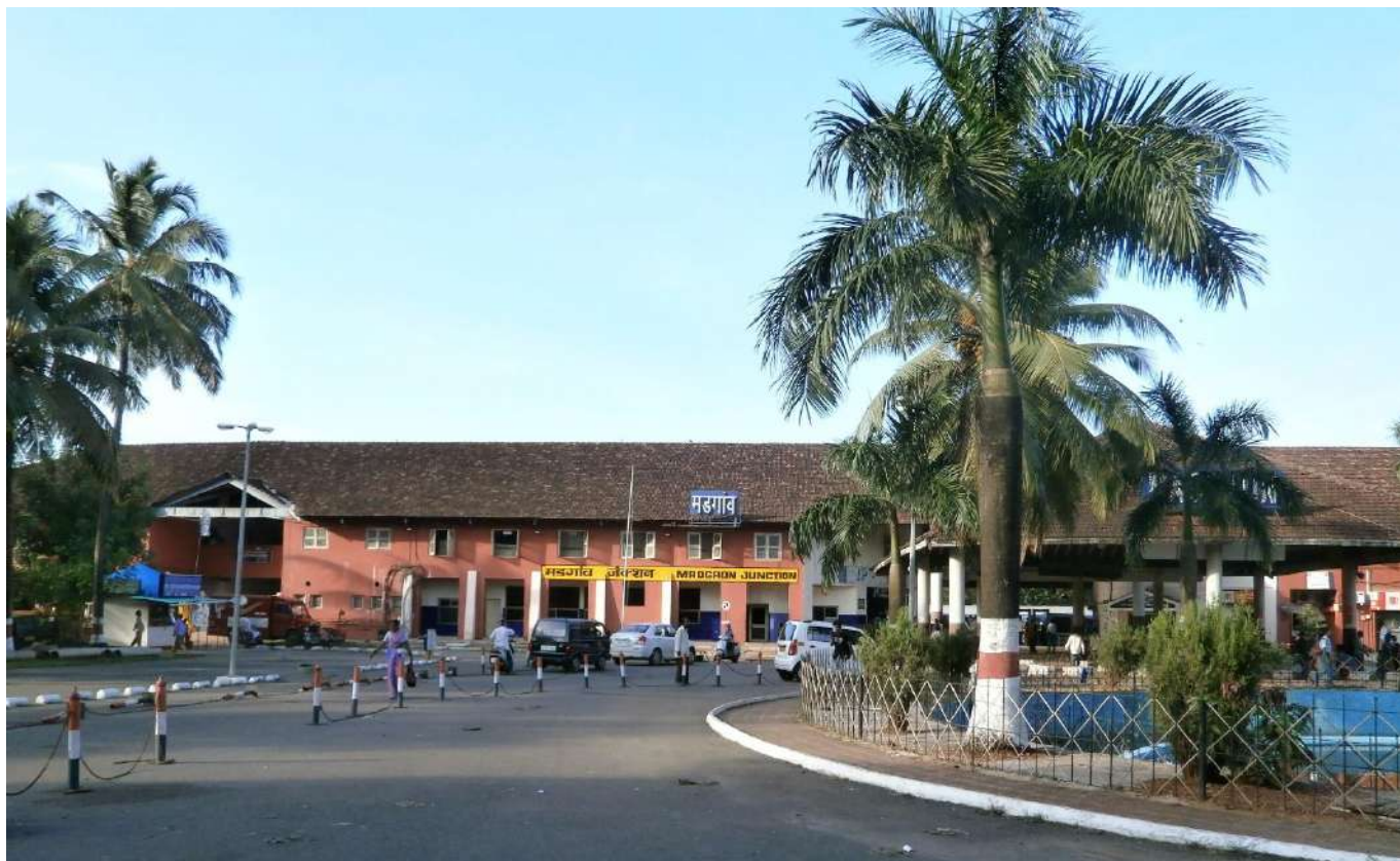
Madgaon Station, Goa