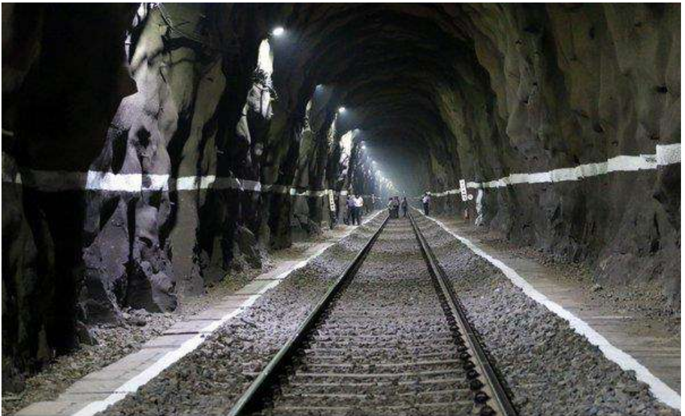
Permanent support in Tunnels - Rock bolts and Shotcreting