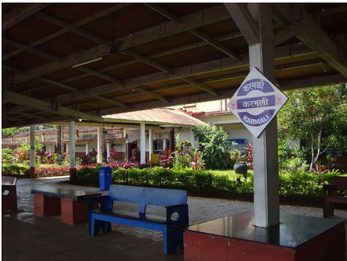
Karmali Station, Goa