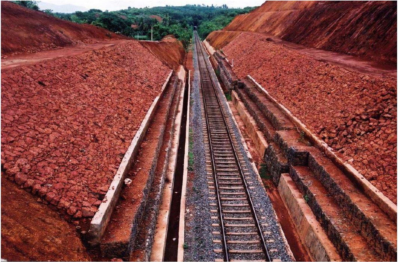
Flattening of Cutting Sides and Protective Works in Soil Cuttings