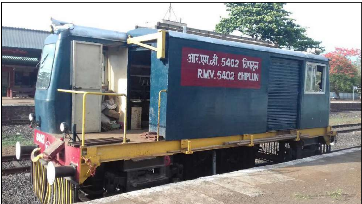
Rail Maintenance Van