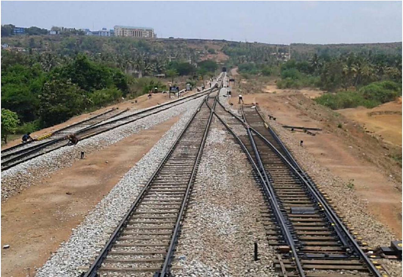
Thick Web Switches in Turn-outs