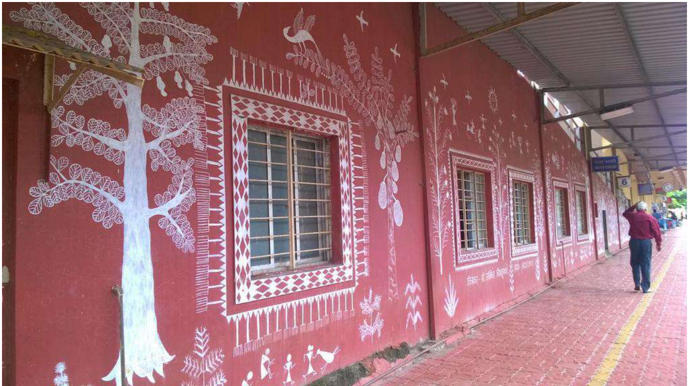
Paintings on Ratnagiri Station Building Walls