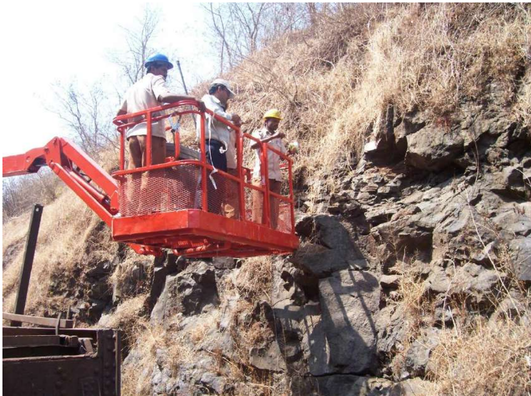
Inspection and Loose scaling in Rock Cuttings using Boom List