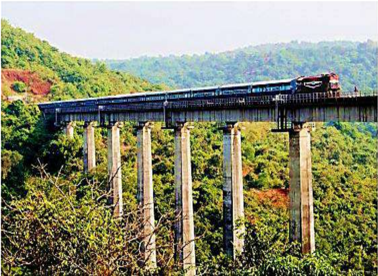
Panval Viaduct- Tallest Bridge on Konkan railway