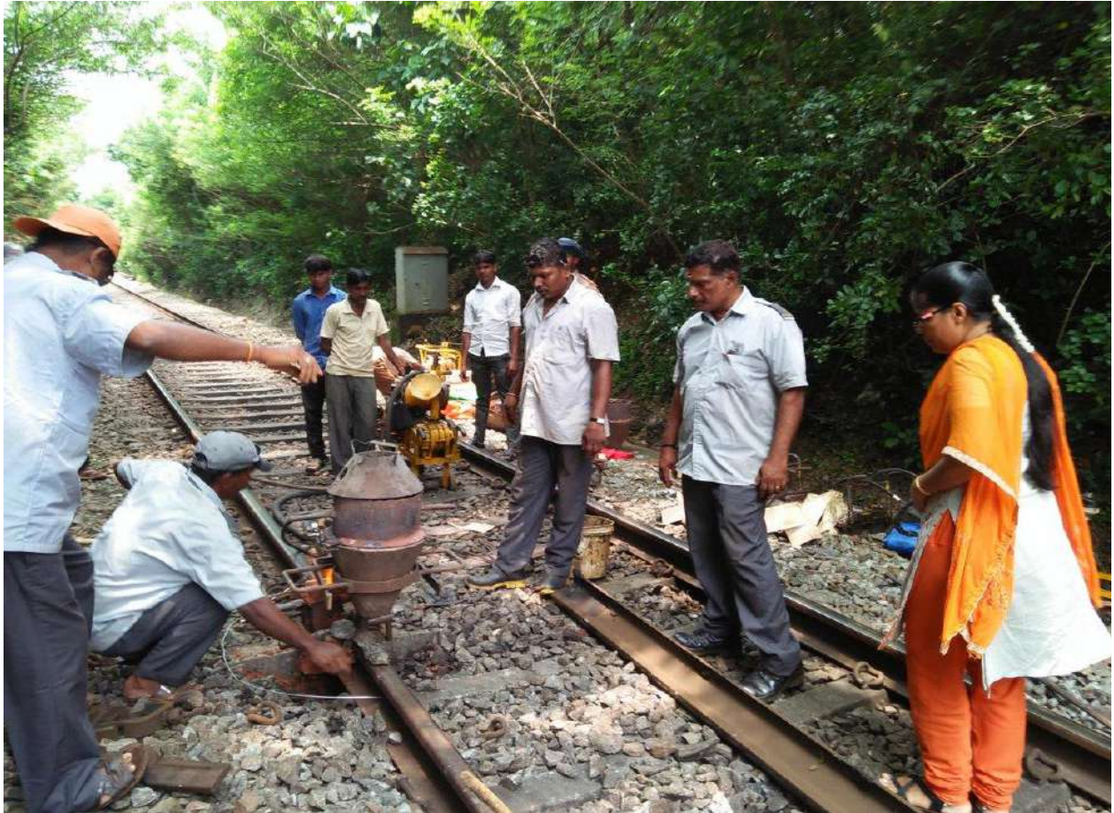
Alumino- Thermic Welding of Rails