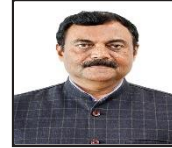
Shri R.K. HEGDE